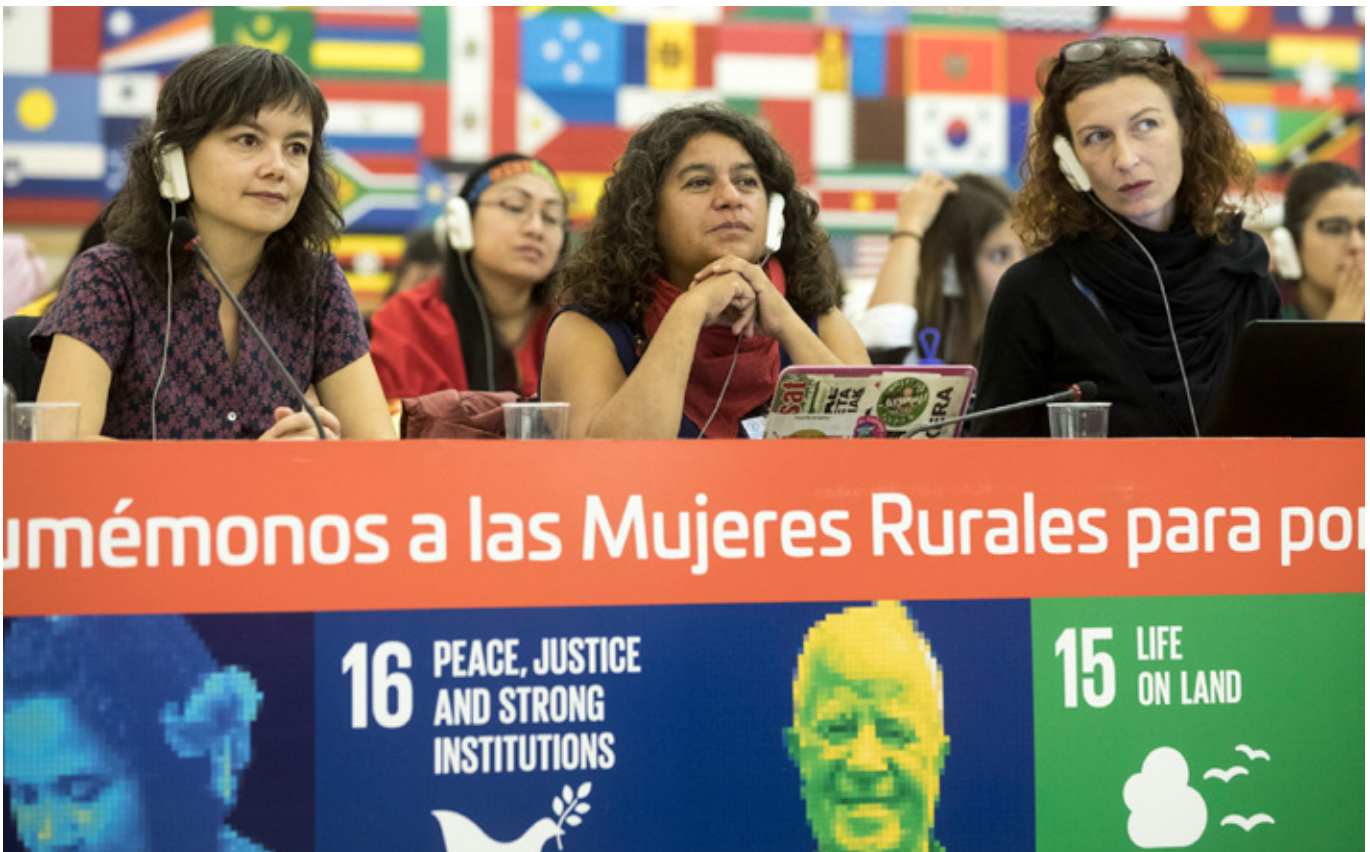
Women's Forum