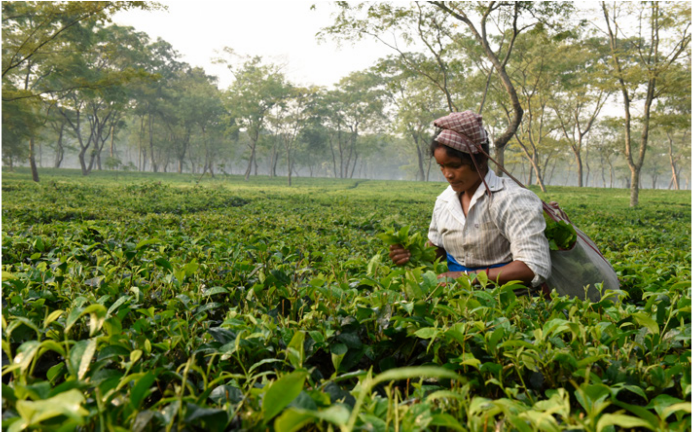
Female tea plucker—West Bengal, India.