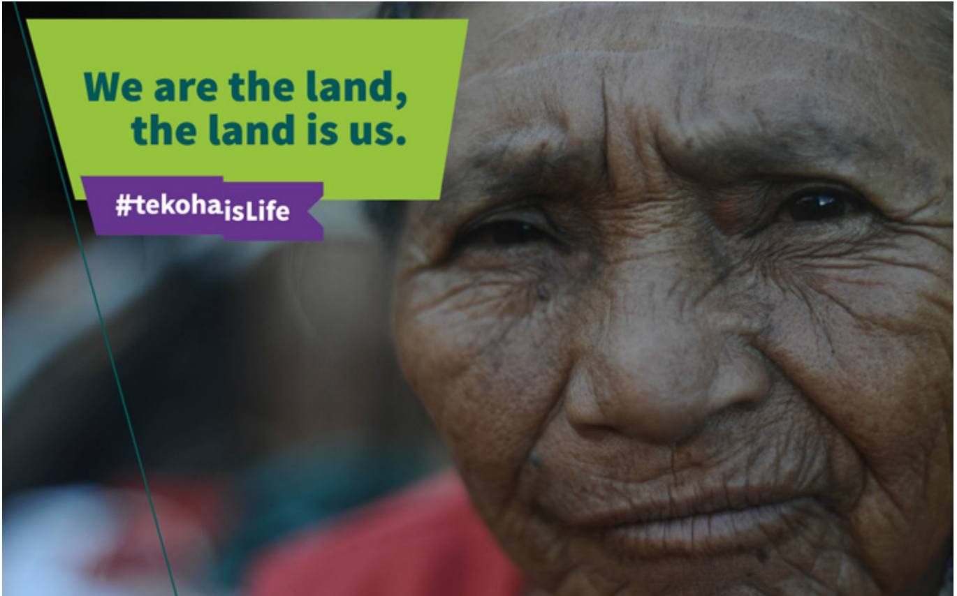
Awareness-raising initiative #TekohaisLife