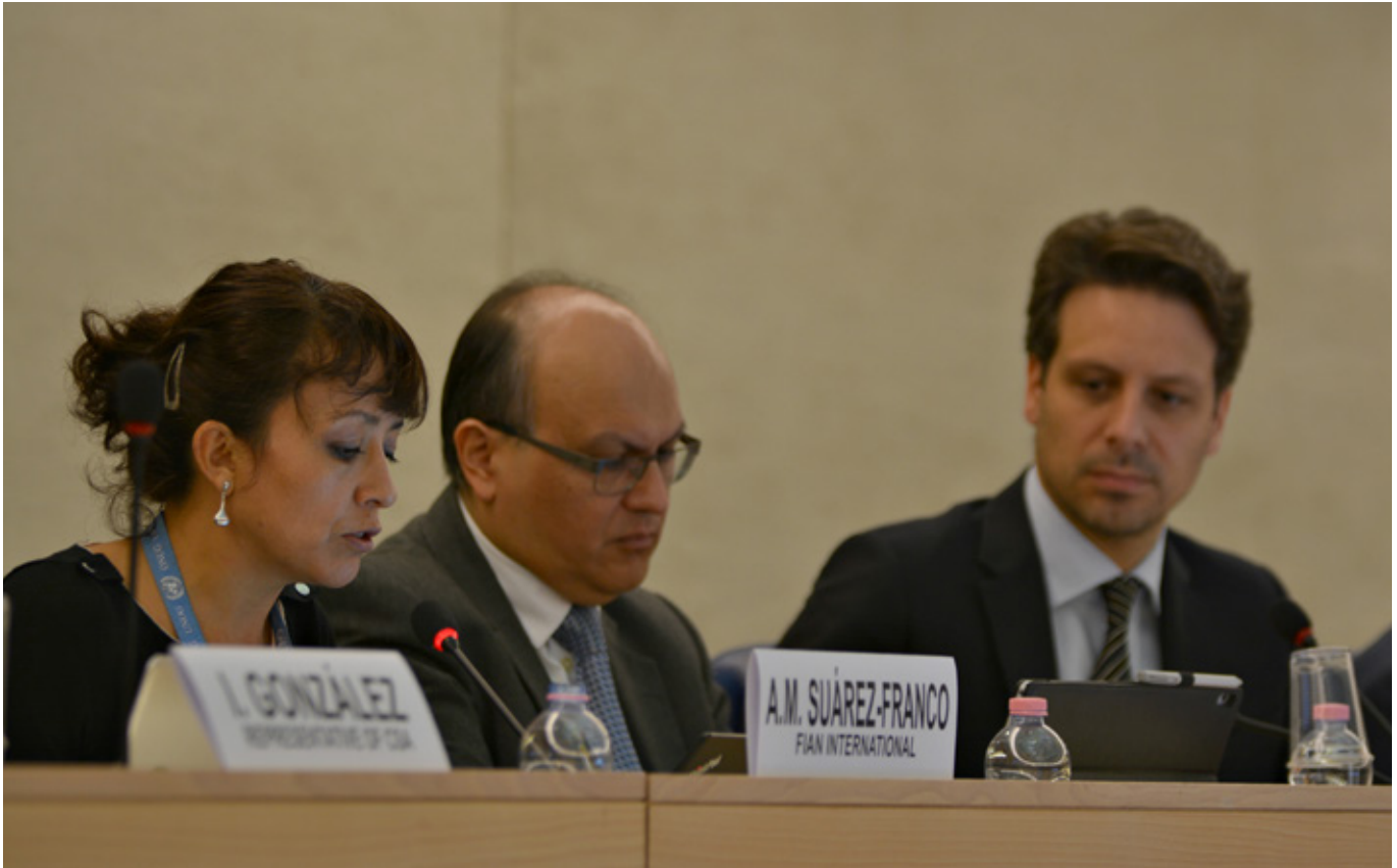
FIAN International's representative to the UN, at an expert panel—Geneva, Switzerland