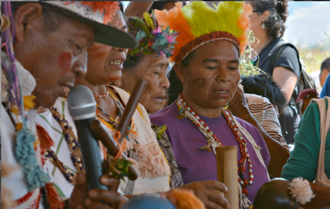
Guarani and Kaiowá indigenous people at traditional ritual before local gathering—Mato Grosso do Sul, Brazil