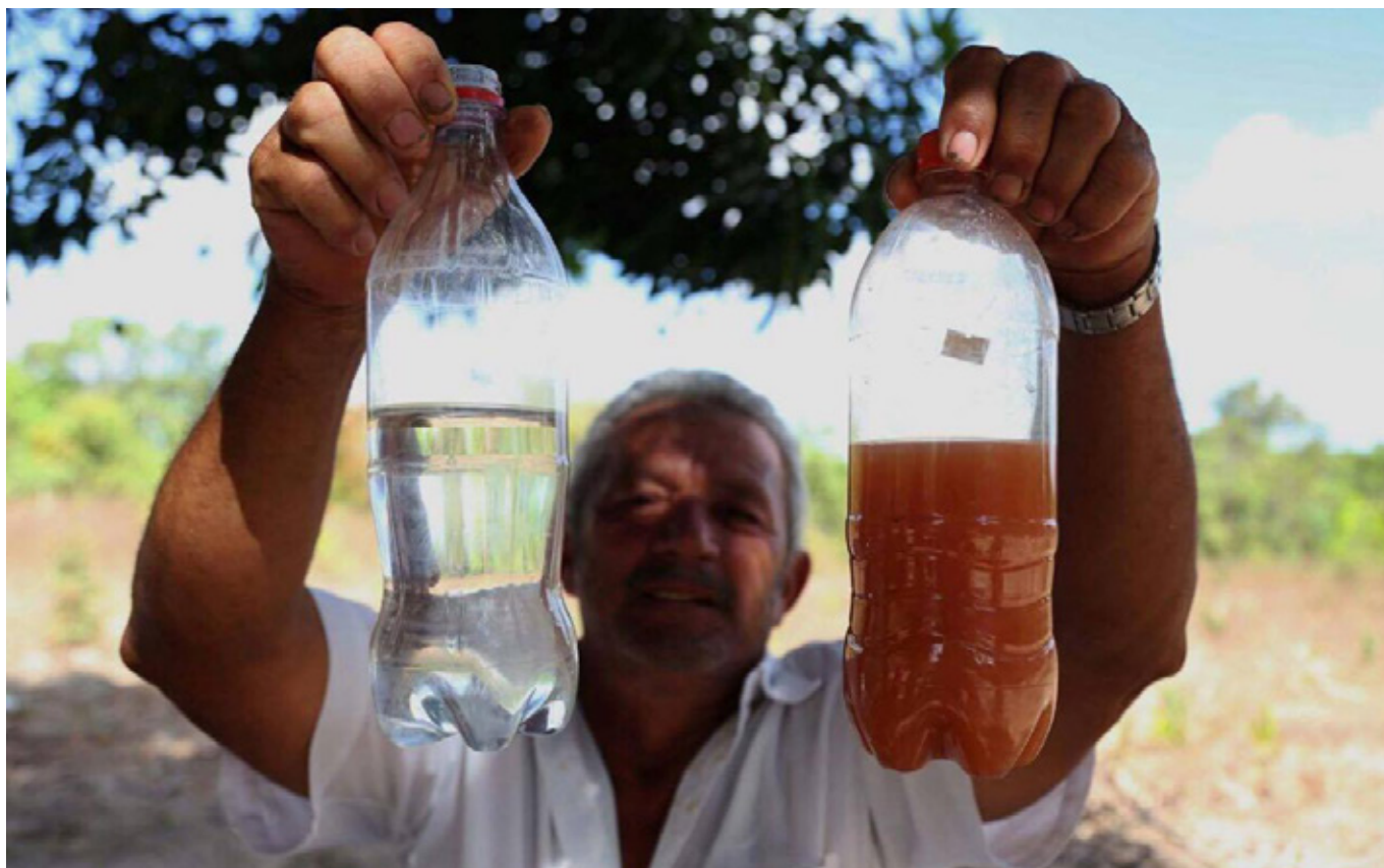
Villager holding two bottles, including one with polluted water—Piauí, Brazil