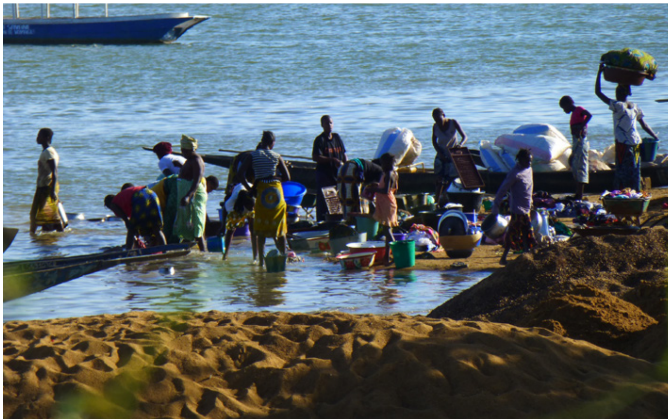
Fisherfolk at sunset—Mali