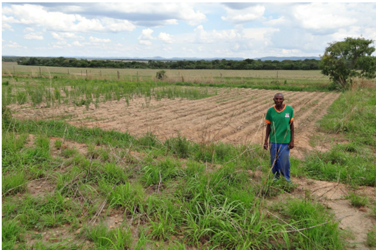
Small plot of land from a member of the Ngambwa community, who is facing eviction—Zambia

Besides deepening in the issue of malnutrition, FIAN Austria conducted a study that uncovers the alliances between governments, UN-institutions and corporations of the agri-food industry, which come at the cost of people's health and environment. In return to financial support in form of investments, countries of the global south apply their nutrition and health policies in line with corporate interests. Laws and policies, which promote genetically modified food,