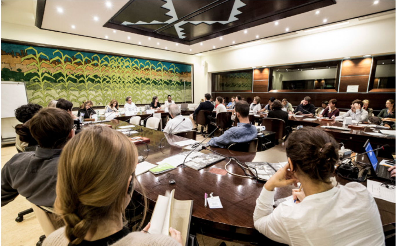
International event of the Right to Food and Nutrition Watch at UN FAO Headquarters—Rome, Italy