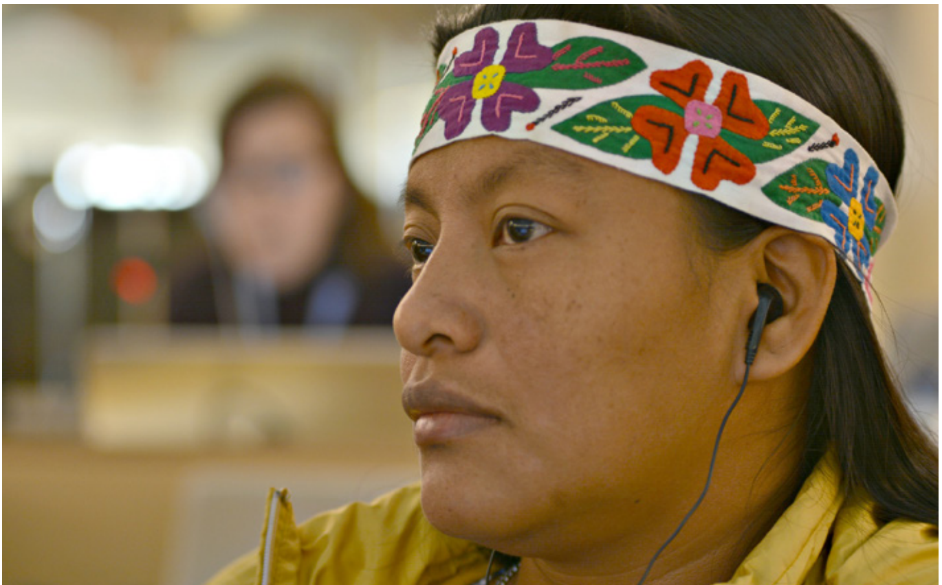
Indigenous woman representative at UN negotiations at the Human Rights Council—Geneva, Switzerland