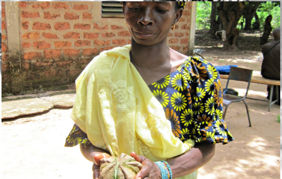
Woman holding some harvest —Burkina Faso