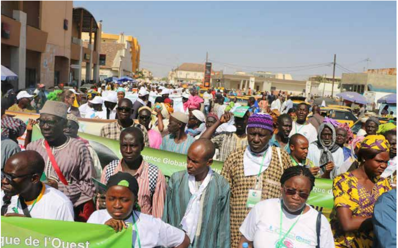
People from across West Africa demonstrate in support of the Caravan—Kaolack, Senegal