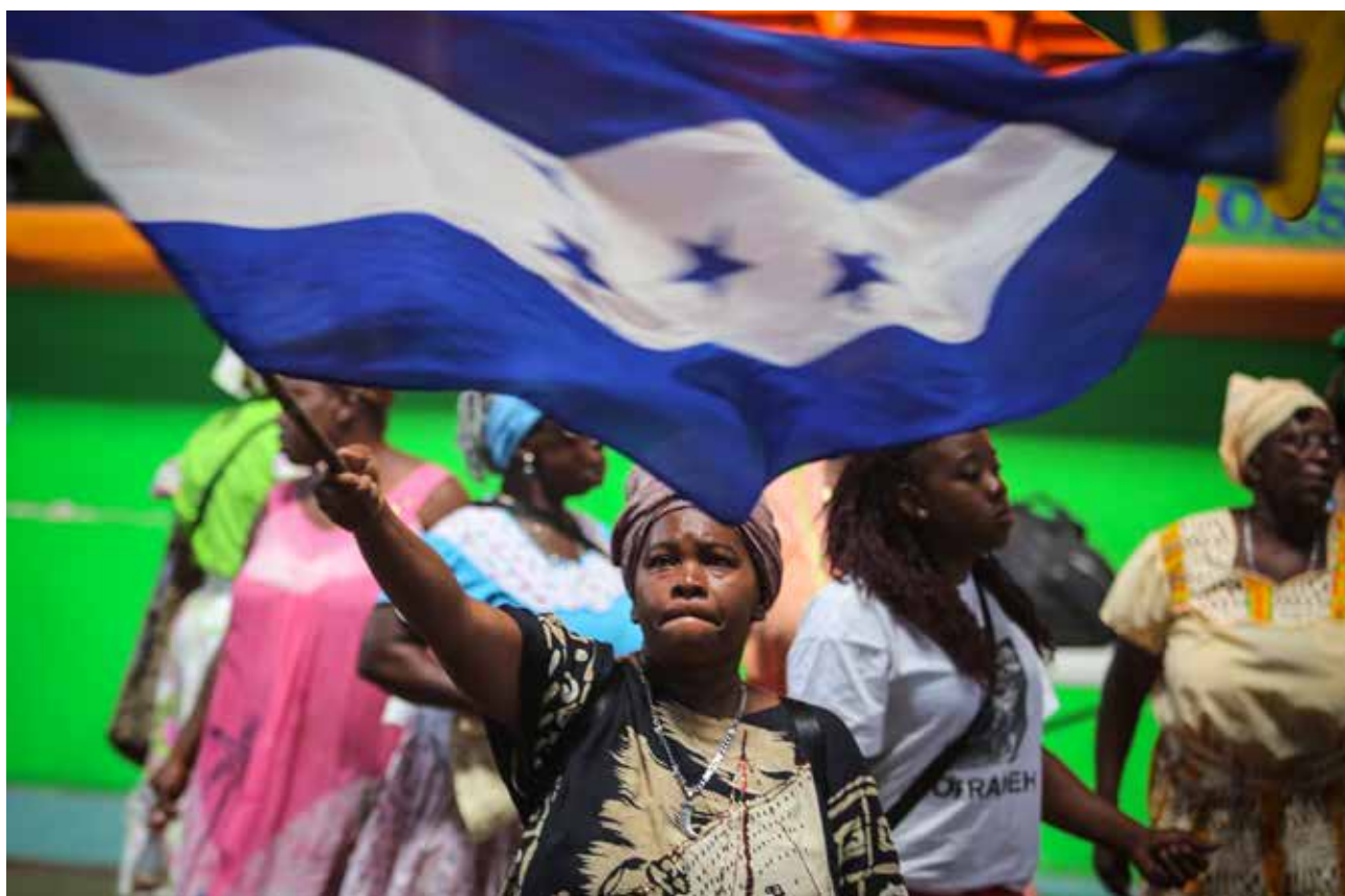
Front cover of parallel report to CESCR —Honduras.

FIAN Switzerland monitored the negotiations of the Trade in Services Agreement (TISA) and conducted considerable research on the potential impacts of TISA on the rights to food and to water . The findings were presented and discussed at a public event with the head of the Swiss delegation and at a conference at the University of Berne.