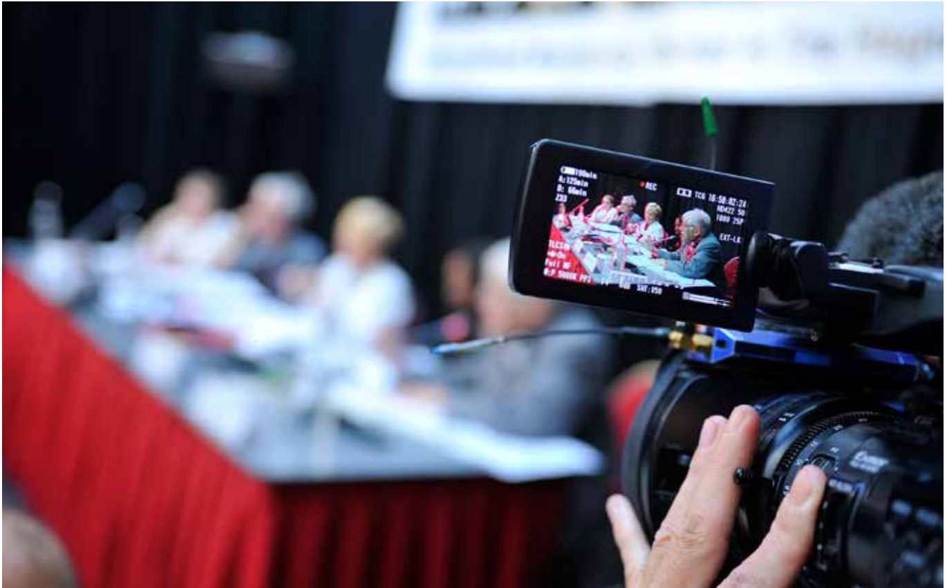
Internationally renowned judges hearing witnesses and experts on Monsanto's activities—The Hague, Netherlands