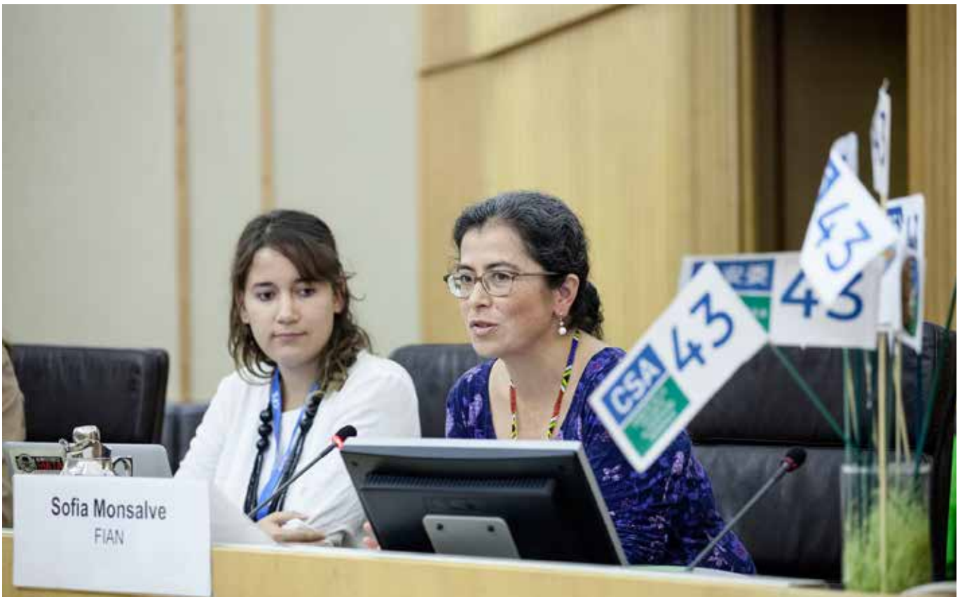
FIAN International's Secretary General speaking on the use of the Tenure Guidelines at CFS 43 side event —Rome, Italy