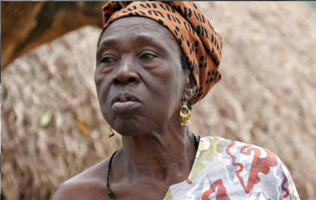
Woman from a community affected by business operations—Sierra Leone