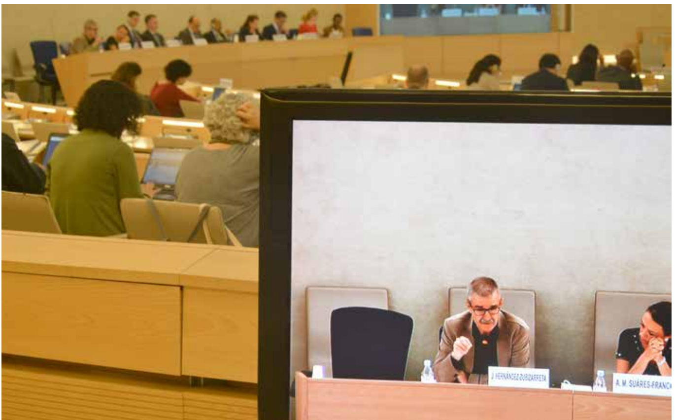
Second session of the UN Working Group towards the Binding Treaty—Geneva, Switzerland