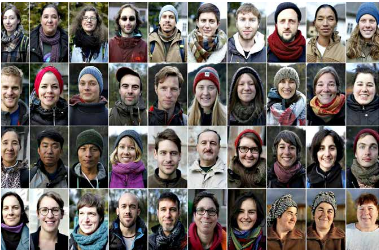
Some of the 600 participants from across Europe and Central Asia at 2nd the Nyéléni Europe Forum—Cluj-Napoca, Romania

FIAN Belgium continued advocacy work for a ‘UN Declaration on the Rights of Peasants and other people working in rural areas’ (RoP declaration) by supporting a