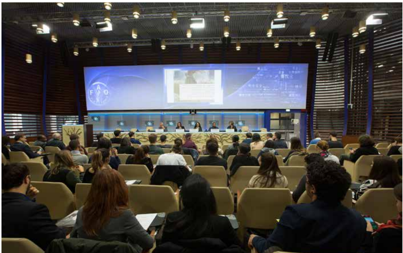
International event of the Right to Food and Nutrition Watch at UN FAO Headquarters—Rome, Italy