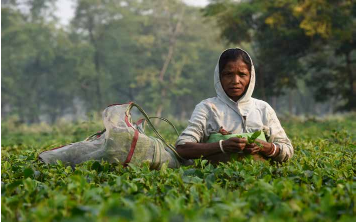
Female tea plucker—West Bengal, India