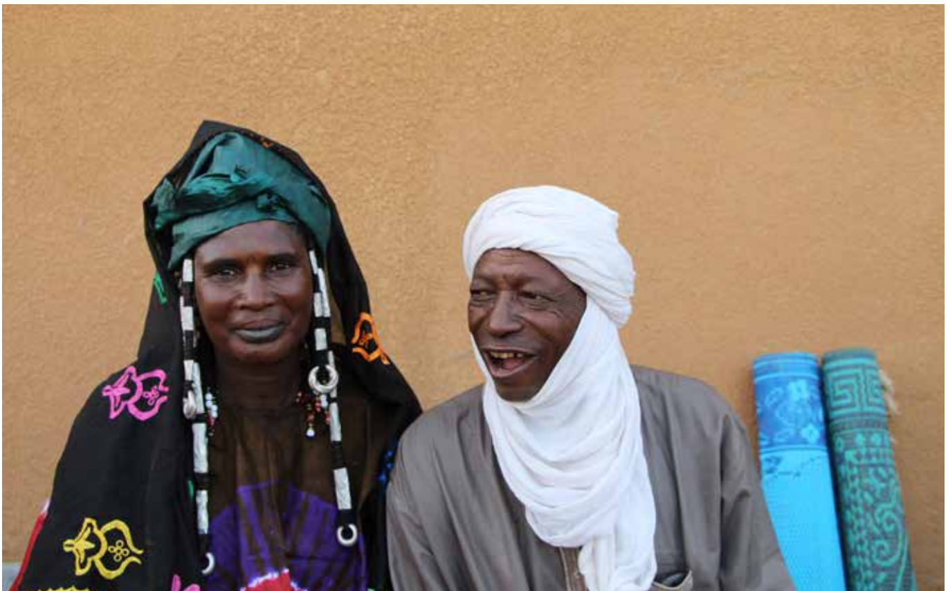
Affected communities by mining activities —Essakane, Burkina Faso