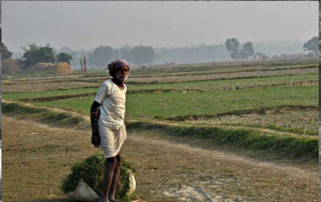
Farmer in Kakardari —Uttar Pradesh, India