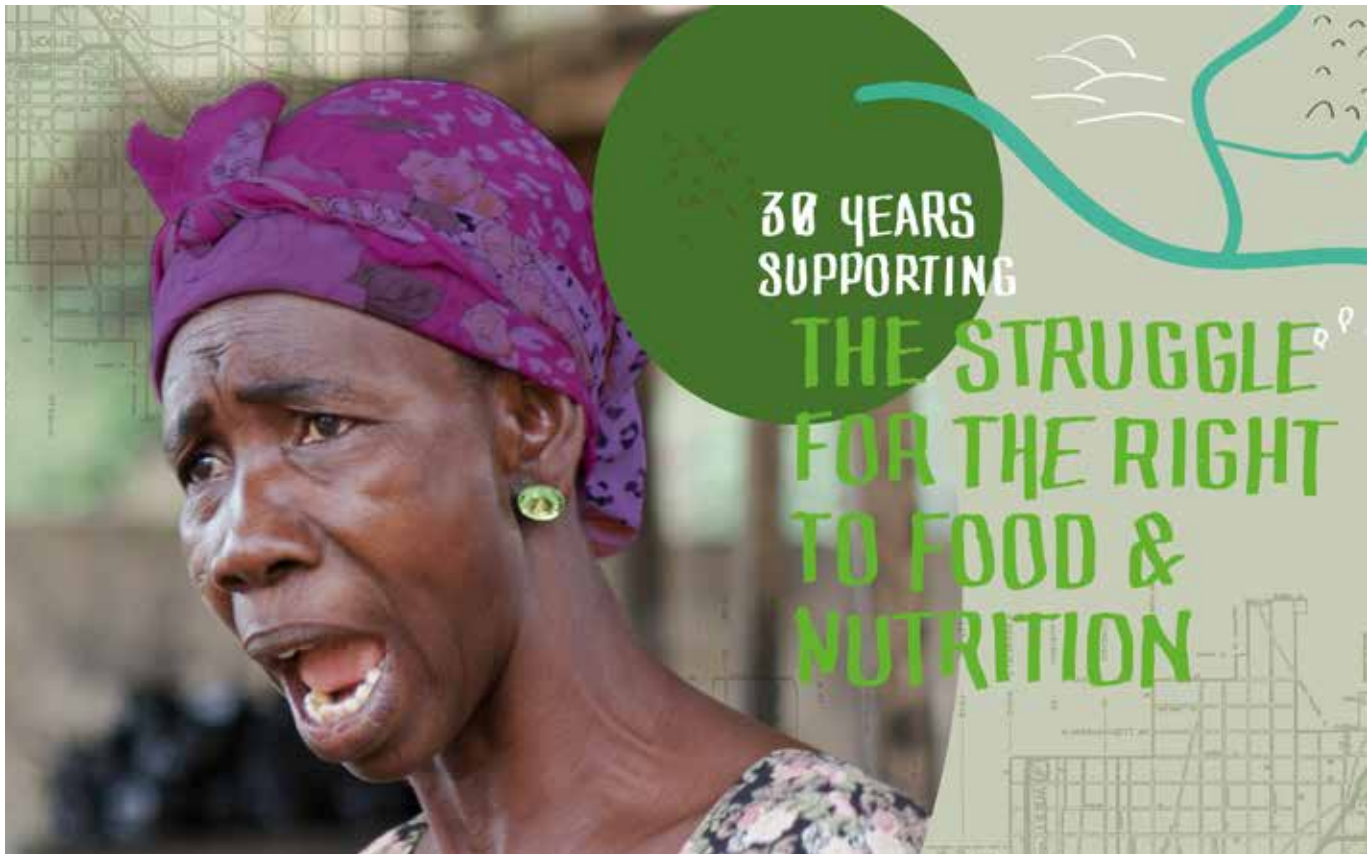
Supporting the struggle for the right to food and nutrition for 30 years—Ghana