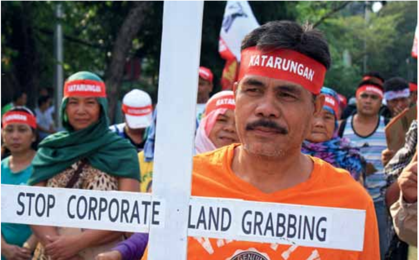
↑ Demonstrators walk across the streets to support the Philippines' Agrarian Reform program—Manila, Philippines.