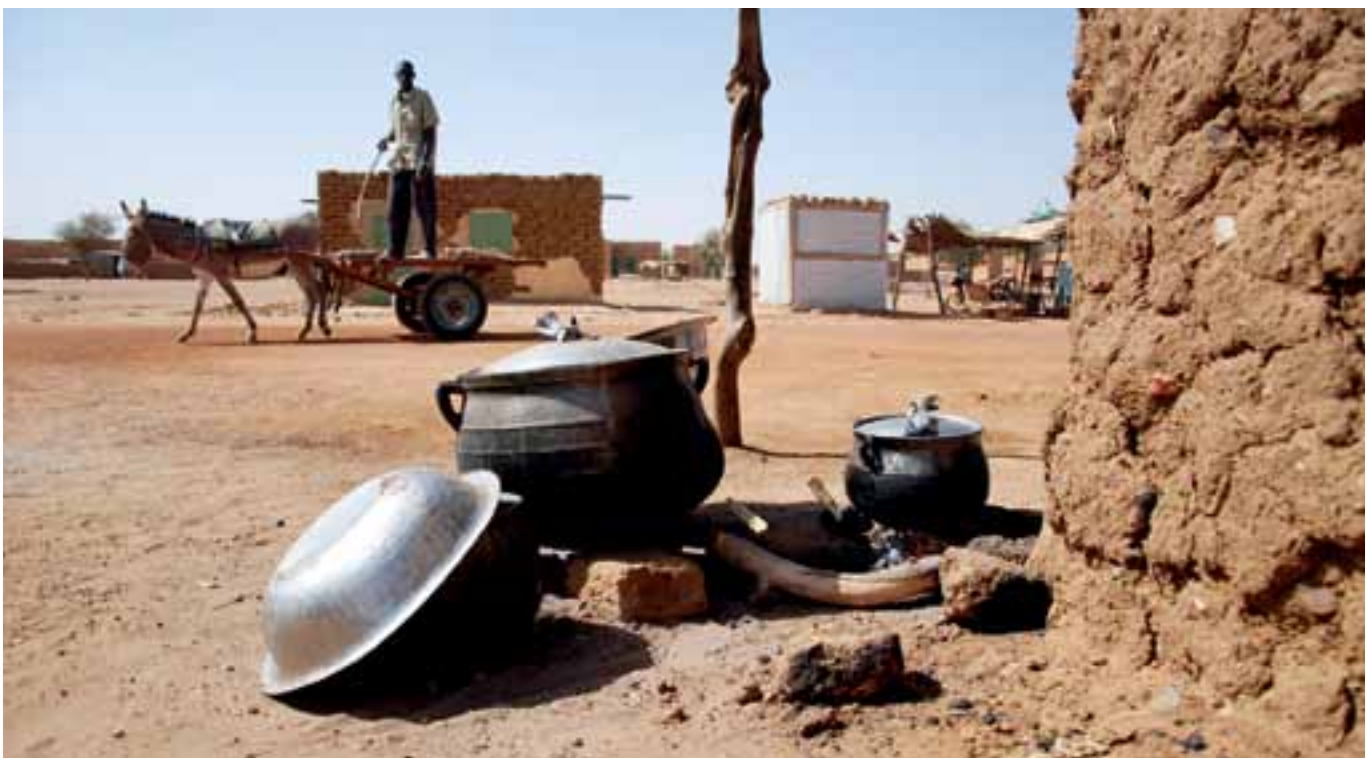
↑ Essakane Village, affected by the impact of mining—Burkina Faso.

In 2014 FIAN Zambia supported FIAN Germany in the fact finding missions and meetings in Zambia for the elaboration of the desk study "Fast track agribusiness expansion, land grabs and the role of European private and public financing in Zambia: A right to food perspective". The meetings involved the government, traditional leaders and the affected Kalukwiso and Mimbolo communities, who are facing threat of being evicted, or are already evicted, by foreign companies. Additionally, FIAN Zambia attended the Conference on Extraterritorial Obligations of States that took place in Kampala (Uganda) in August to explore the role of foreign actors in the access of natural resources in Africa. Other major activities by FIAN Zambia included the continued monitoring of the Zambian constitution building process, where it was envisaged that the right to food could be recognized in the bill of rights. In terms of lobby work, FIAN Zambia continued dialogue on the right to food with policy makers through bilateral meetings with members of parliaments, key stakeholders and through press briefings and statements; as well as consulting with traditional leaders and grassroots communities. ▾