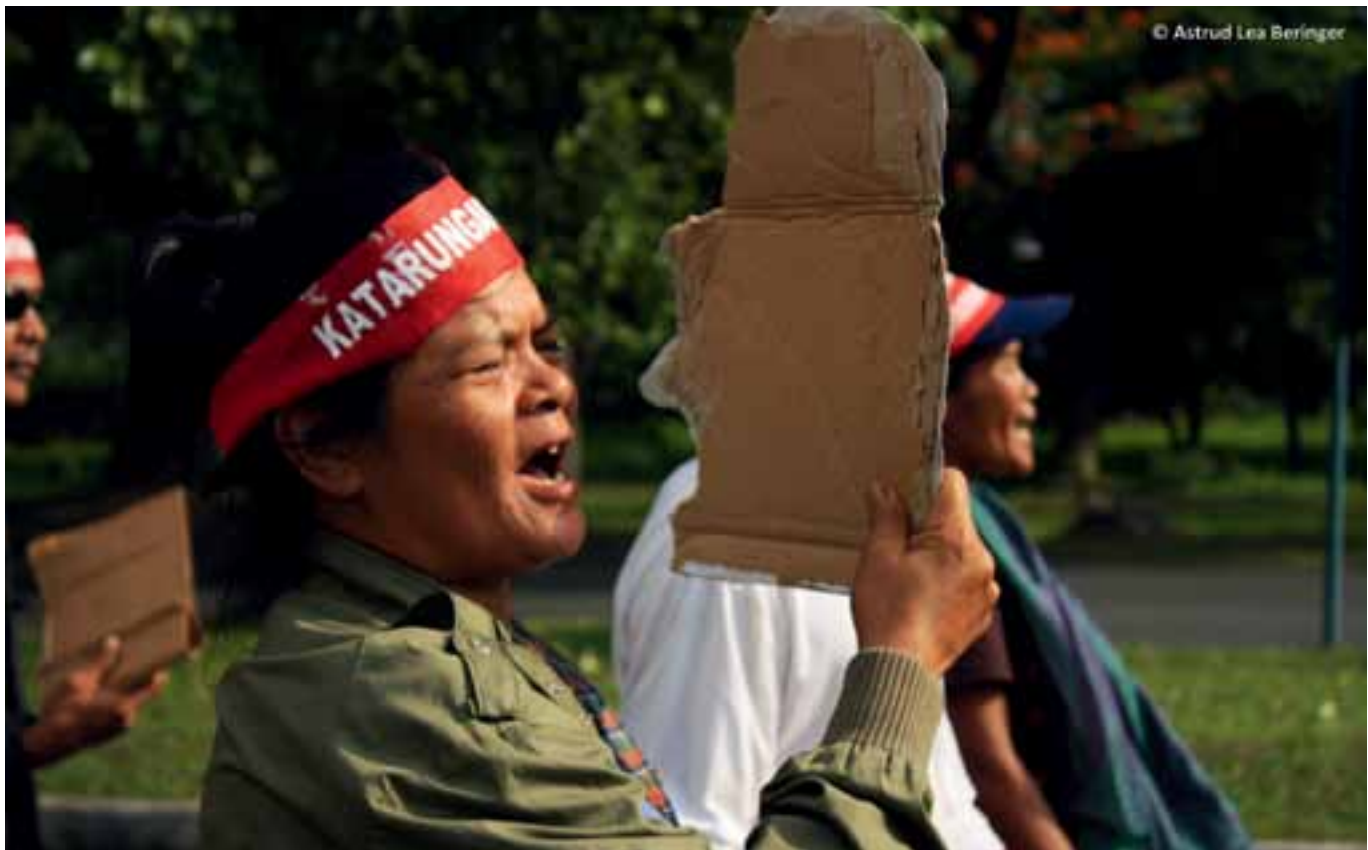
↑ Mobilizations in favor of saving the Agrarian Reform Program—Manila, Philippines.

Camotán is one of the poorest municipalities in Guatemala ; over half of children under five are malnourished. Chronic malnutrition is the result of a situation of extreme poverty, characterized by insufficient food, poorly paid jobs, limited access to land, and substandard basic services. In 2013, landmark decisions by a juvenile Court declared the State responsible by omission for the violation of the right to food and other human rights of five undernourished children living in Camotán. FIAN has supported the process of the lawsuit since its inception, providing advice and working with national coalitions. The sentences represented a milestone in Guatemalan human rights jurisprudence, yet a lack of coordination and political will to fully implement the sentences and an absence of coherence of public policies with human rights were noted in 2014. A report published in July includes observations of a monitoring visit conducted by FIAN on the implementation of the judgments issued by the Court, which was followed up by an international fact-finding mission carried out in November–December 2014. FIAN International will continue to work with local groups to monitor and ensure the full implementation of this unprecedented ruling in favour of the right to adequate food. The report of the mission will be available in mid-2015. ▀