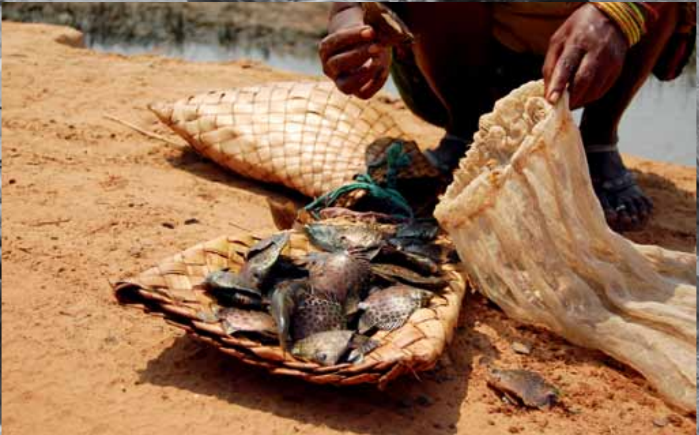
↑ Fisherman counting his haul—Chalaivendran, India.