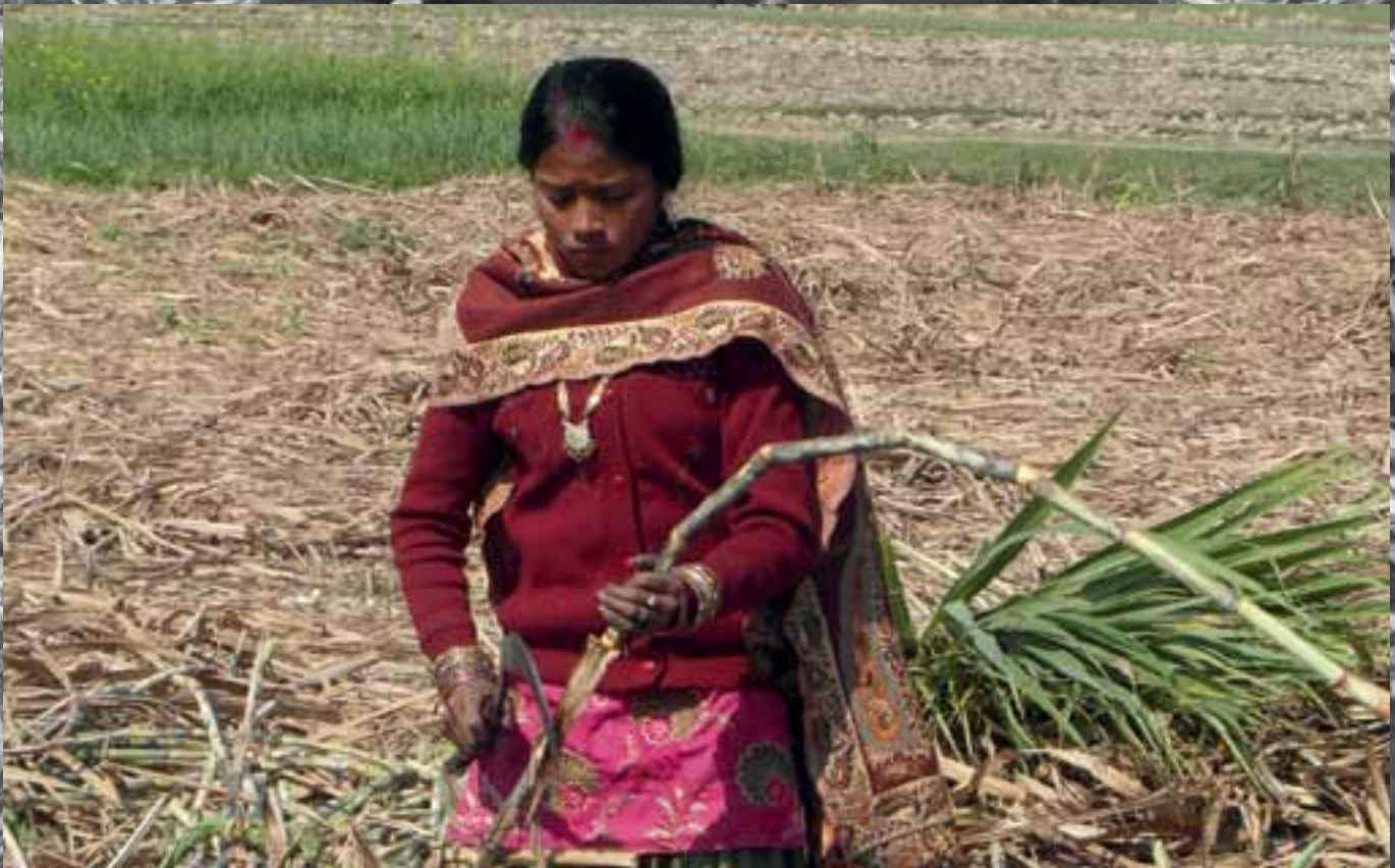
↑ Woman harvesting sugar cane—Nepal.