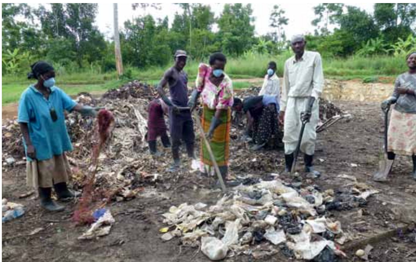
↑ Villagers who had been evicted from their land work on a garbage dump to earn their living — Mubende, Uganda.

The Sawhoyamaxa indigenous community in Paraguay celebrated a historic victory in June 2014, as an expropriation bill enabled the community to return to its ancestral lands after over twenty years of struggle and resistance, in compliance with the Inter-American Court of Human Rights ruling of 2006. As a result of a takeover of ancestral land by a private company in the 1990s, the indigenous community has suffered from lack of access to nutritious food, health facilities and education. FIAN International, jointly with local organizations, has been supporting the claims of the Sawhoyamaxa over the last eight years. Between April and June 2014, open letters were sent by FIAN International to the Paraguayan authorities calling for the adoption of the expropriation bill and increased compliance with the State's human rights obligations. Although the adoption of the expropriation bill is certainly a historic development, the expropriated land owners continue to challenge the bill and the communities do not enjoy control over their territory yet. FIAN will continue monitoring the situation