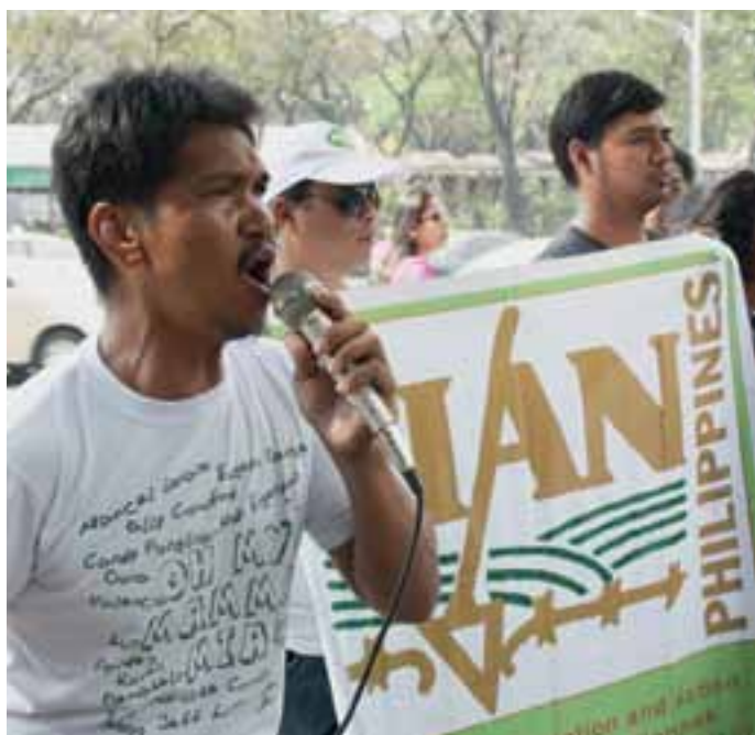
↑ Protests in the capital demanding the agrarian reform— Manila, Philippines.

Another highlight in 2014 included the advances in the Hacienda Matias case. An international urgent action campaign was launched in April to raise awareness about the struggle faced by farmers in this vast 2000-hectare coconut plantation. 260 farmers successfully received their land titles after the Office of the President moved in favor of redistribution of Hacienda Matias in June. However, they still do not have full access to and control over the lands awarded to them and FIAN Philippines will continue to monitor the fulfillment of the land redistribution process. ▀