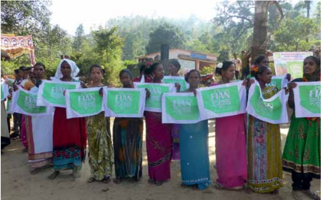
↑ Girls and women celebrating the 25 th anniversary of FIAN India—Araku Valley, India.