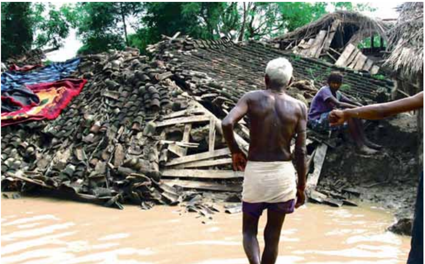
↑ A village devastated by the floods—Banke District, Nepal.

A parallel report on the right to food situation of Nepal was submitted in November to the Committee on Economic, Social and Cultural Rights in Geneva, achieving favourable conclusions from the Committee. The People's SAARC Regional Planning Meeting (People's Movements Uniting South Asia for Deepening Democracy, Social Justice and Peace) was organized and FIAN Nepal, along with the National Right to Food Network, conducted the event "Zero Hunger from South Asian Perspective". FIAN Nepal participated in the ETO Conference held in Bangkok in September and raised issues on extraterritorial obligations of States pertaining to Nepal. ▲