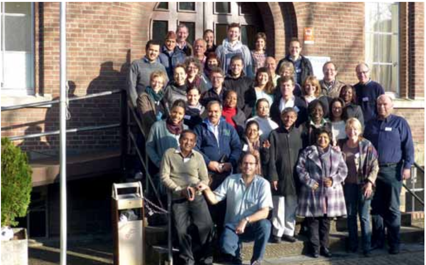
↑ FIAN International Council Meeting in 2014—Vaalbeek, Brussels.