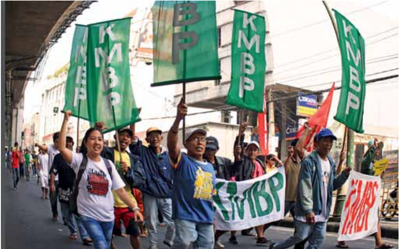
↑ Farmers and activists rallying for the implementation of reforms—Manila, Philippines.