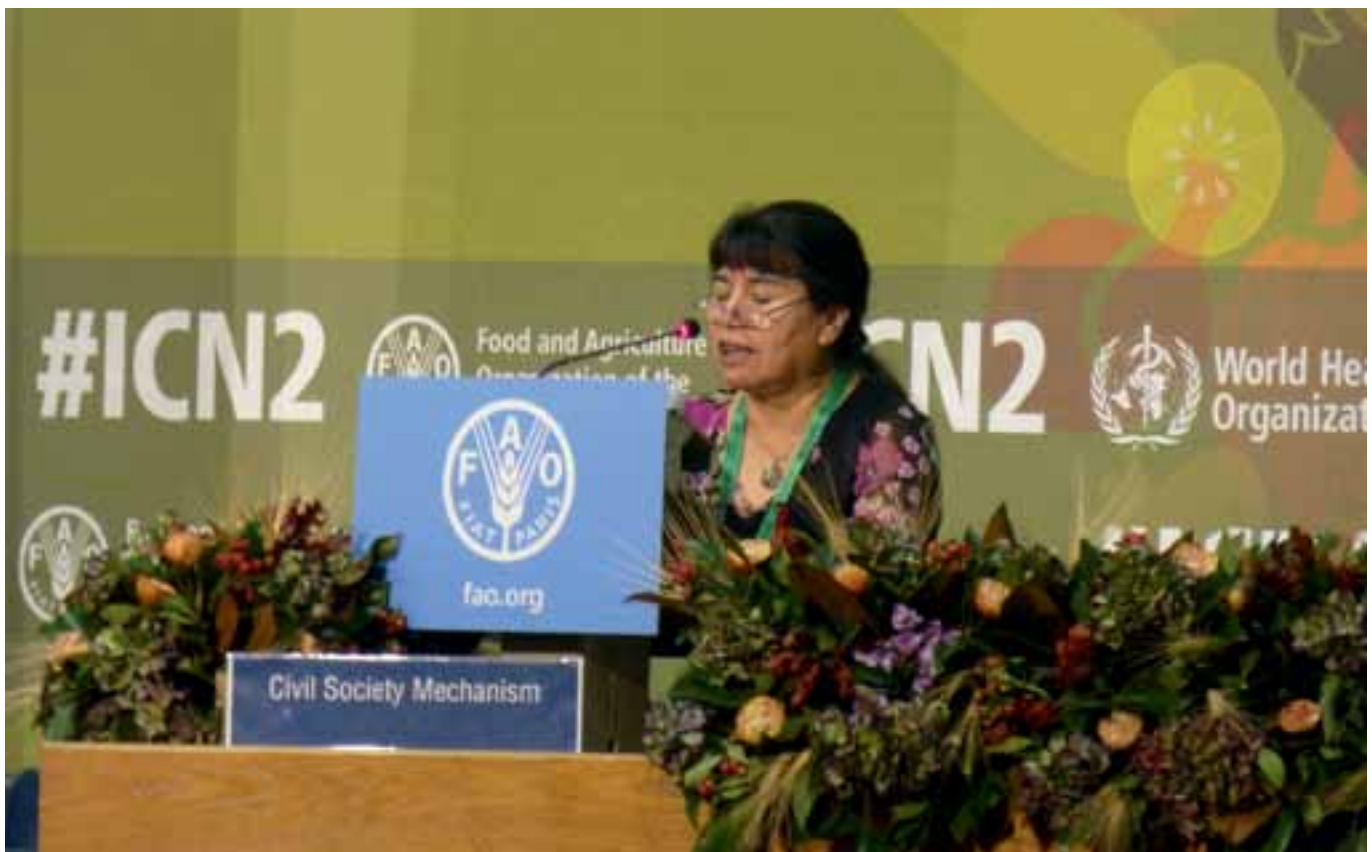
↑ Reading of a civil society declaration at Second International Conference on Nutrition—Rome, Italy