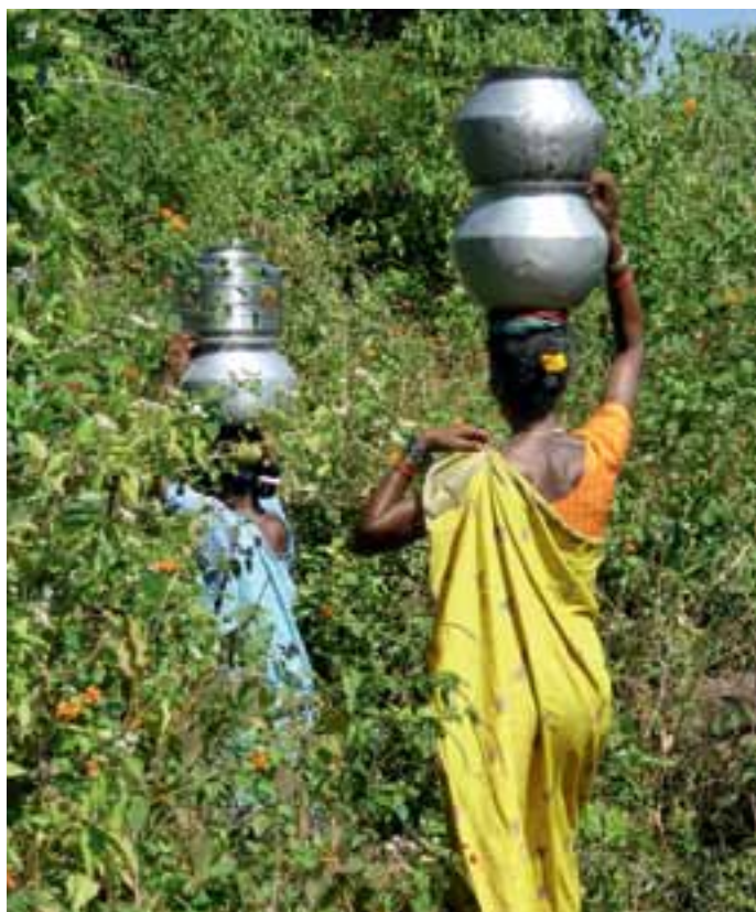
↑ Women fetching water from natural spring, despite not being suitable for human consumption.

FIAN Karnataka organized from April through July a series of workshops of community leaders in the districts of Belgaum, Haveri, Gadag, Bagalkot and Davangere to take stock of the Mahatma Gandhi National Rural Employment Guarantee Act (MGNREGA) and Public Distribution Scheme (PDS) implementation. Over 6,000 people