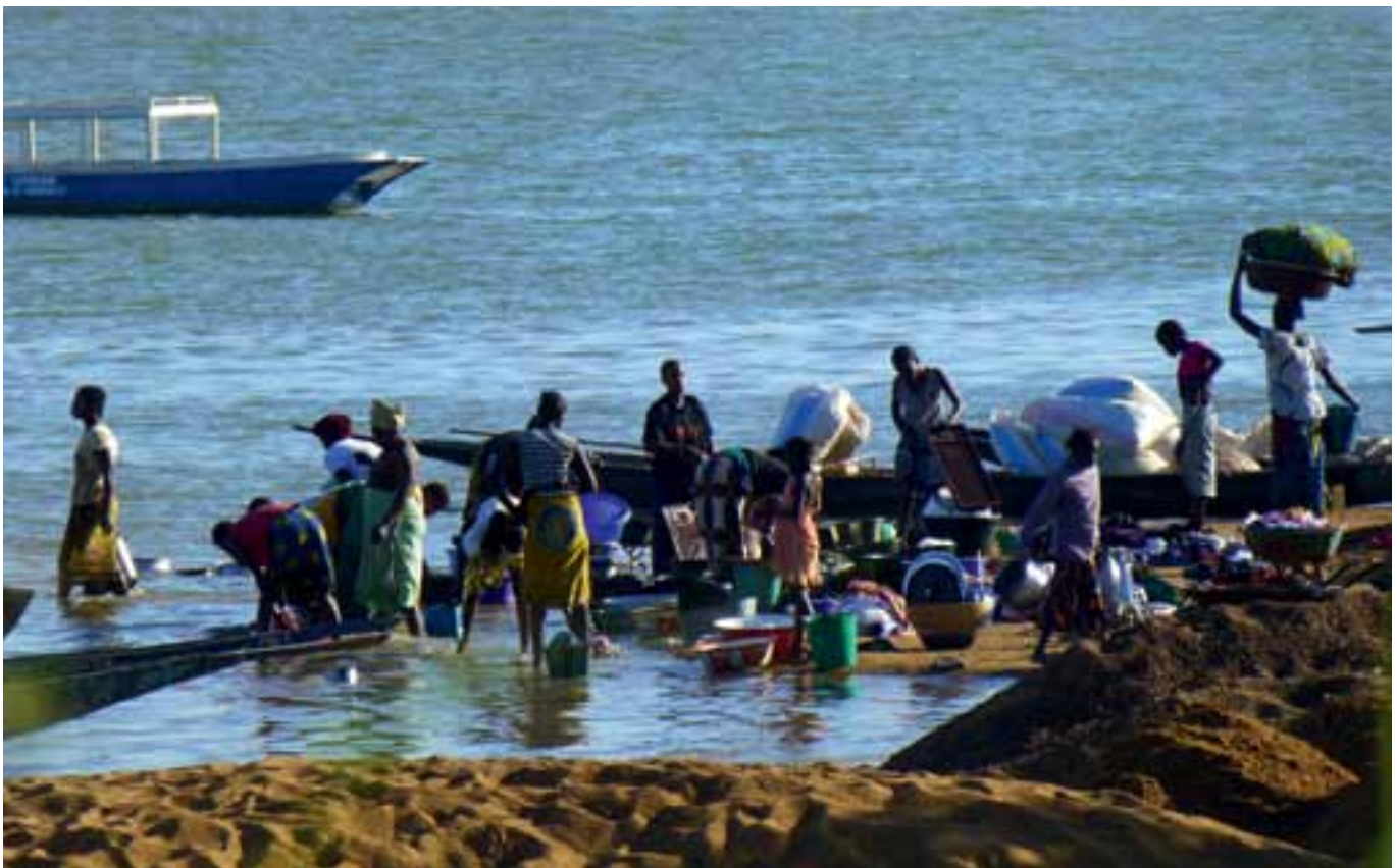
↑ Fisherfolk working at sunset—Mali.