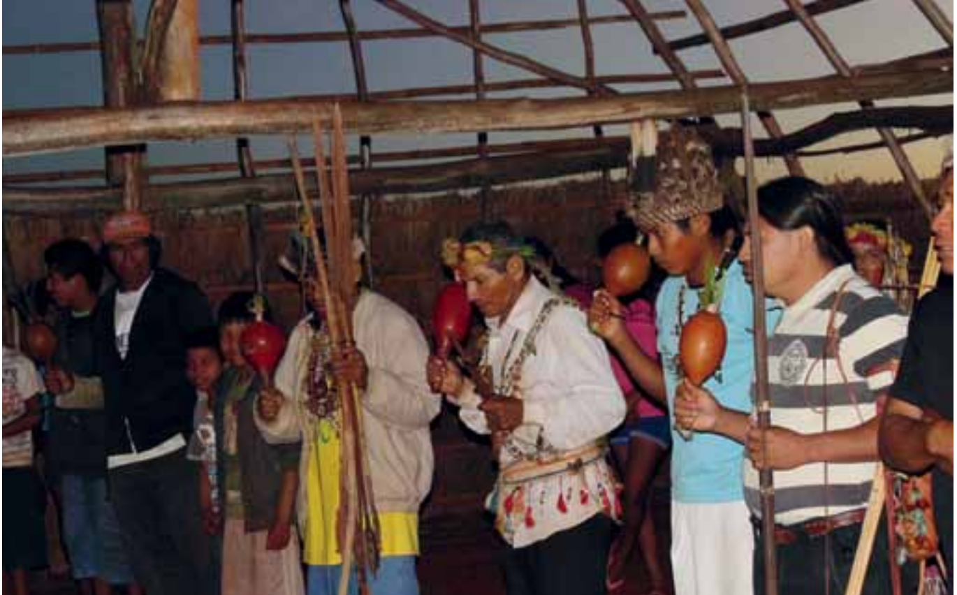
↑ Members of the Guarani-Kaiowá community—Brazil.