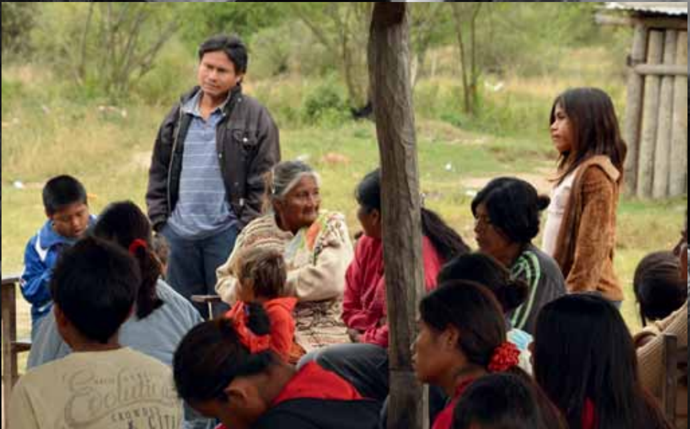
↑ Community members in a meeting—Sawhoyamaya, Paraguay.