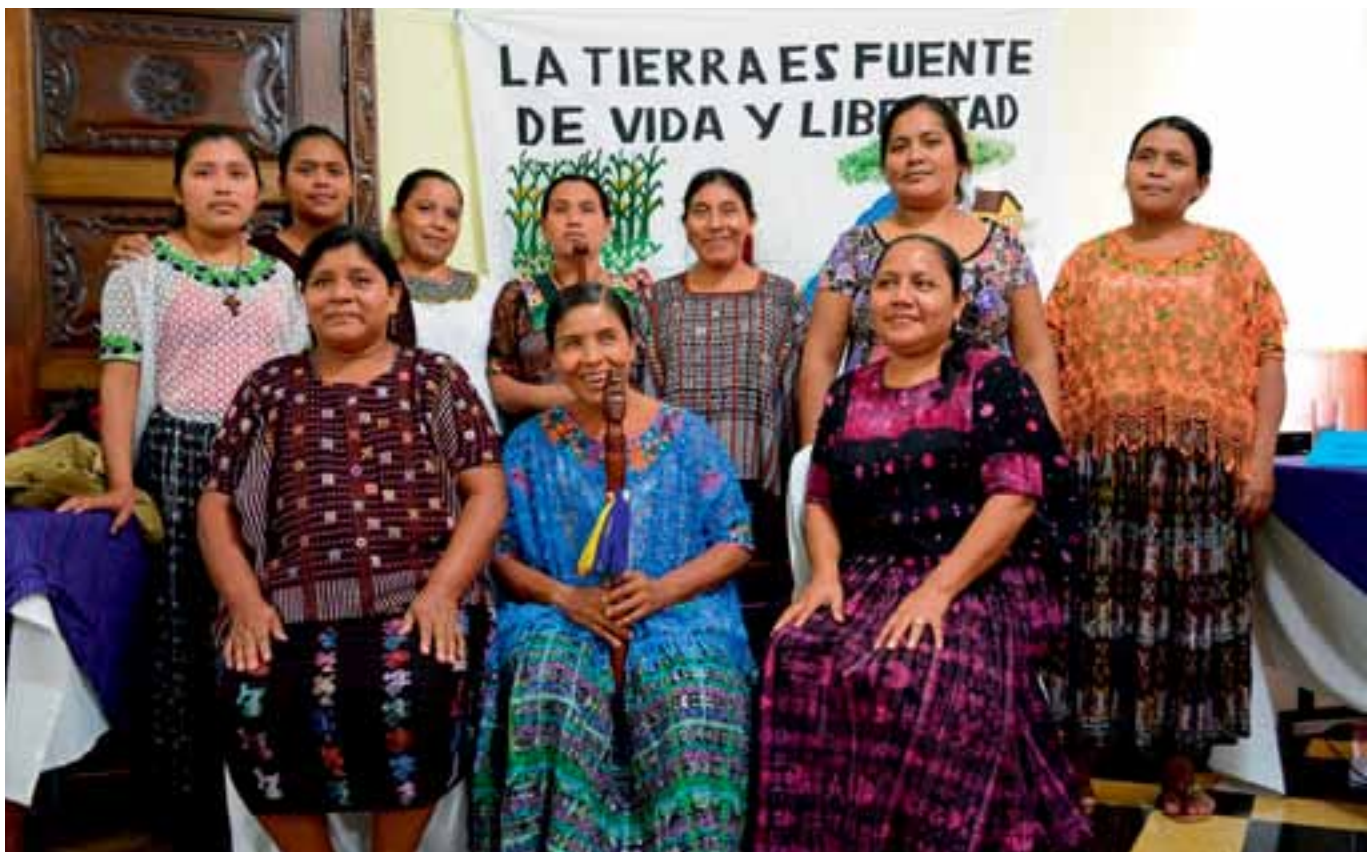
↑ Participants at the public final forum of the International Mission to Guatemala—Guatemala.