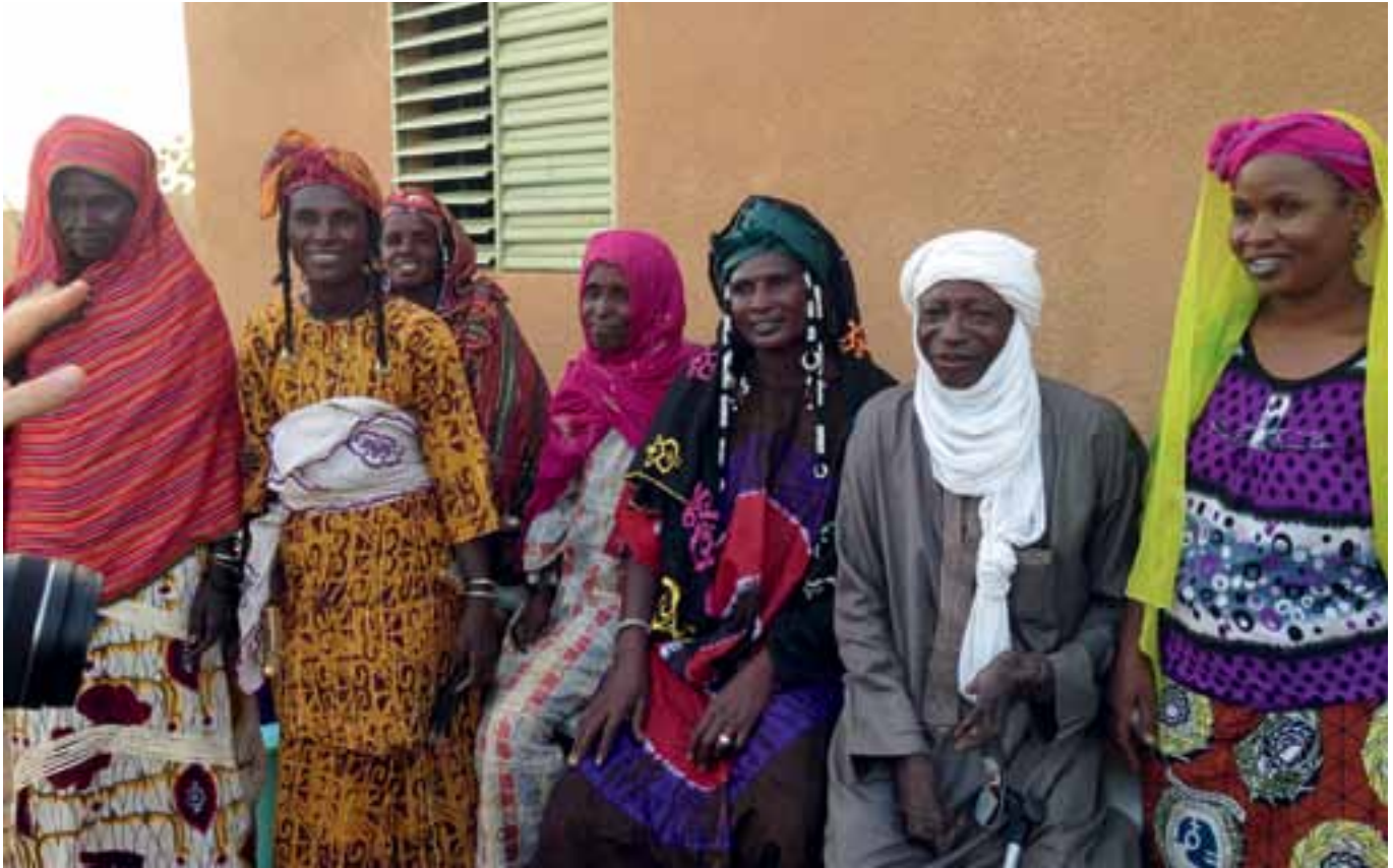
↑ Villagers gathering—Burkina Faso.