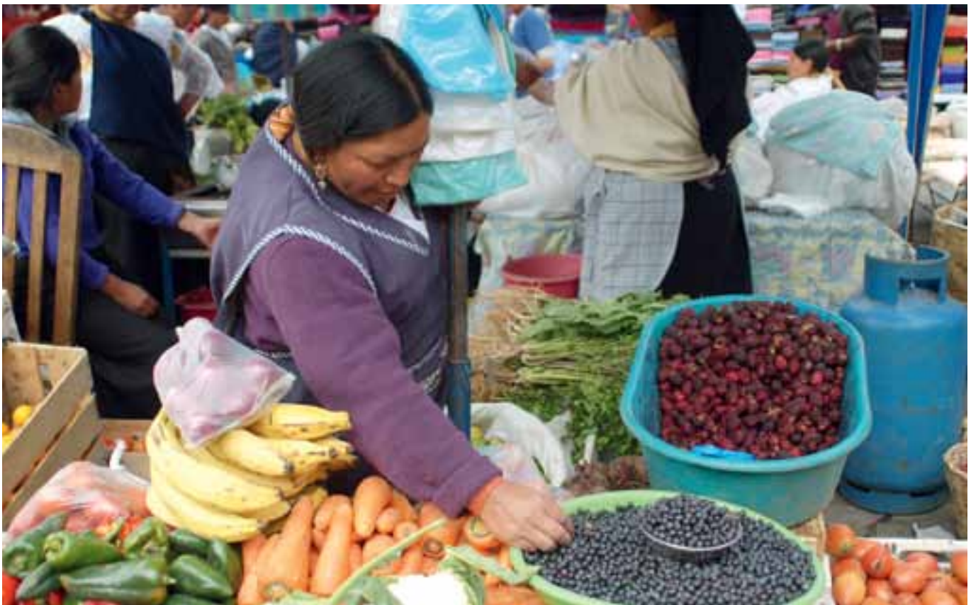
↑ Woman selling at the market—Ecuador.