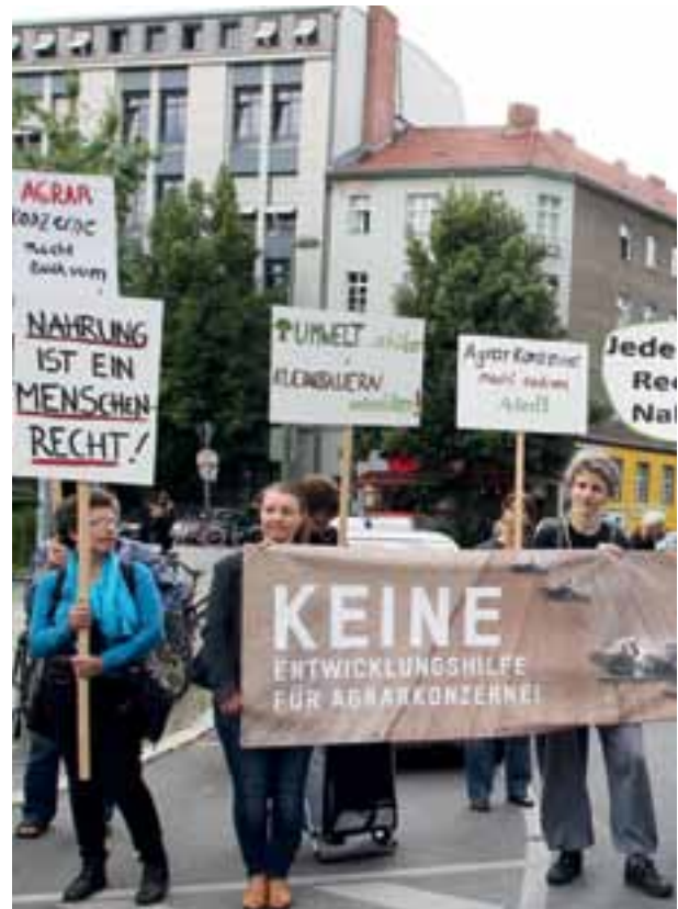
↑ Demonstration against "development aid for agribusiness"—Germany.

FIAN Germany cooperated with FIAN Ecuador and FIAN Paraguay on the issue of criminalization of human rights defenders and continued its support to the evictees of Mubende (Uganda), focusing on malnutrition and gender issues in the case. Other issues addressed in seminars,