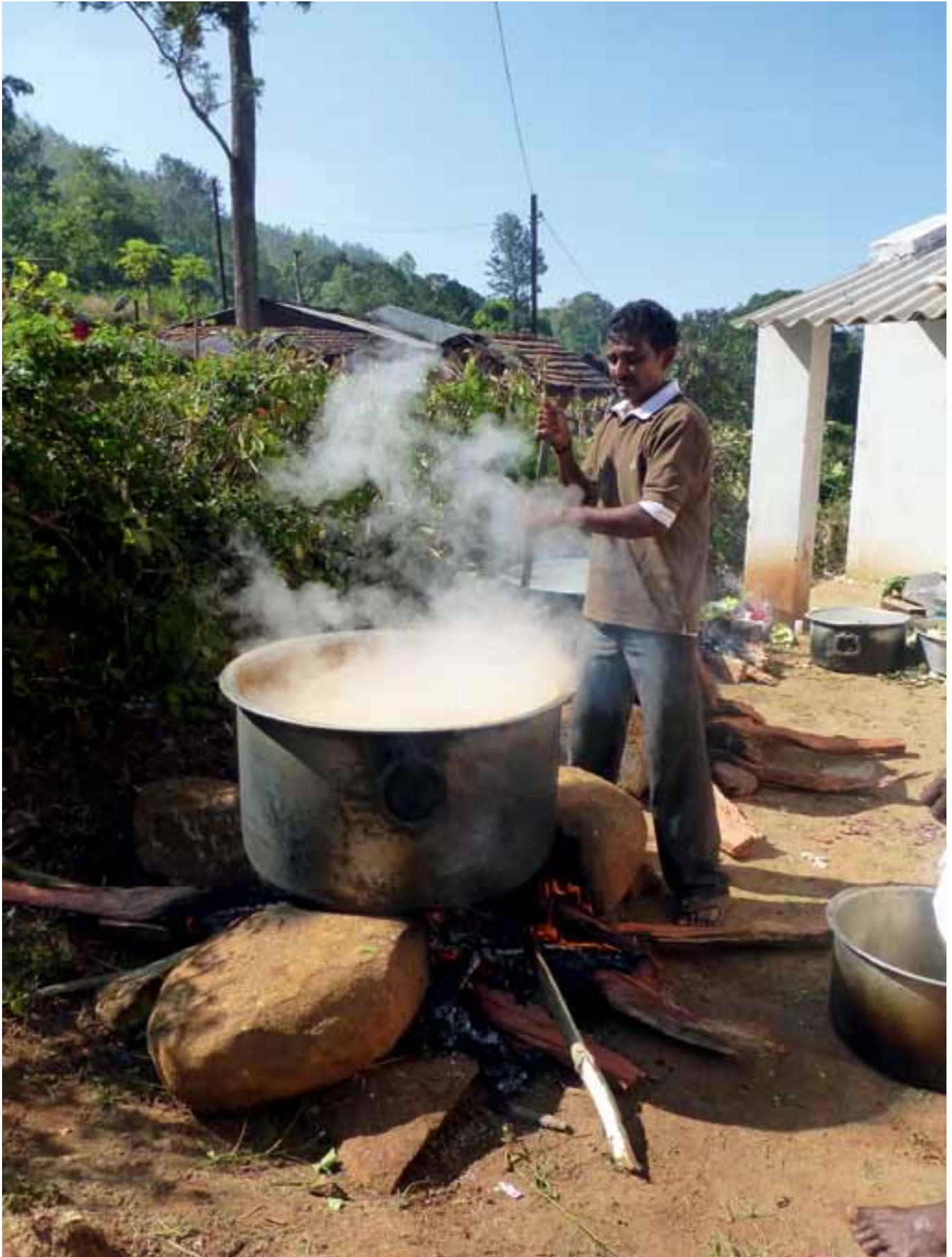
↑ Indian cooking Sambar—a South Indian dish—for the 25 th year anniversary of FIAN—India.