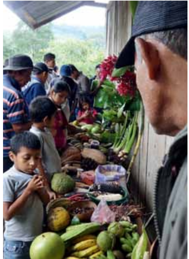
↑ Visit to Guatemalan community during an International Mission—Guatemala.

To further advance the justiciability of the human right to adequate food, 40 Nepali human rights activists and governmental officials gathered in January in Kathmandu to discuss the ratification of the Optional Protocol to the International Covenant on Economic, Social and Cultural Rights and its role in advancing the protection of these rights within Nepal. ▲