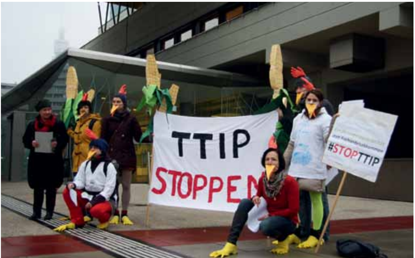
↑ Protesters backing food sovereignty speaking out against TTIP—Vienna, Austria.