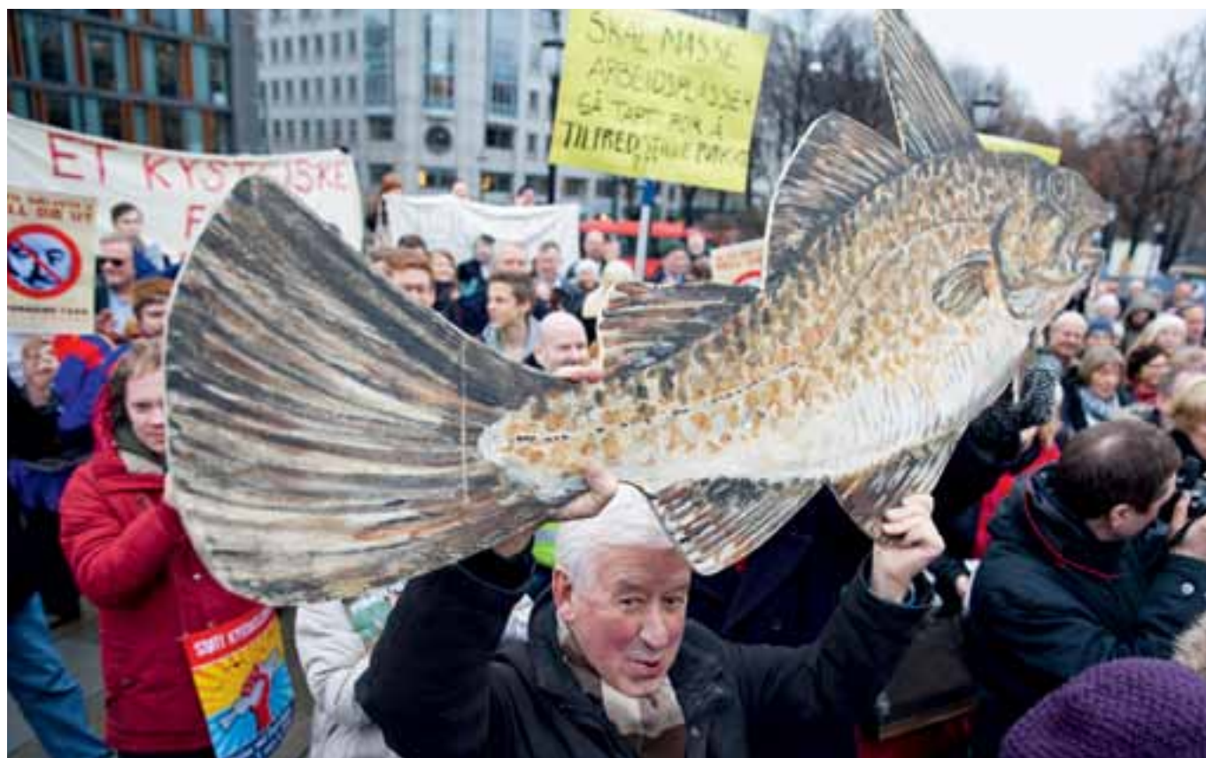
↑ "Fish resources should belong to all" protests in front of Parliament—Norway.

In November, FIAN Sweden hosted an Indigenous leader from Ecuador in a national tour to raise awareness about the ten-year long struggle of the communities