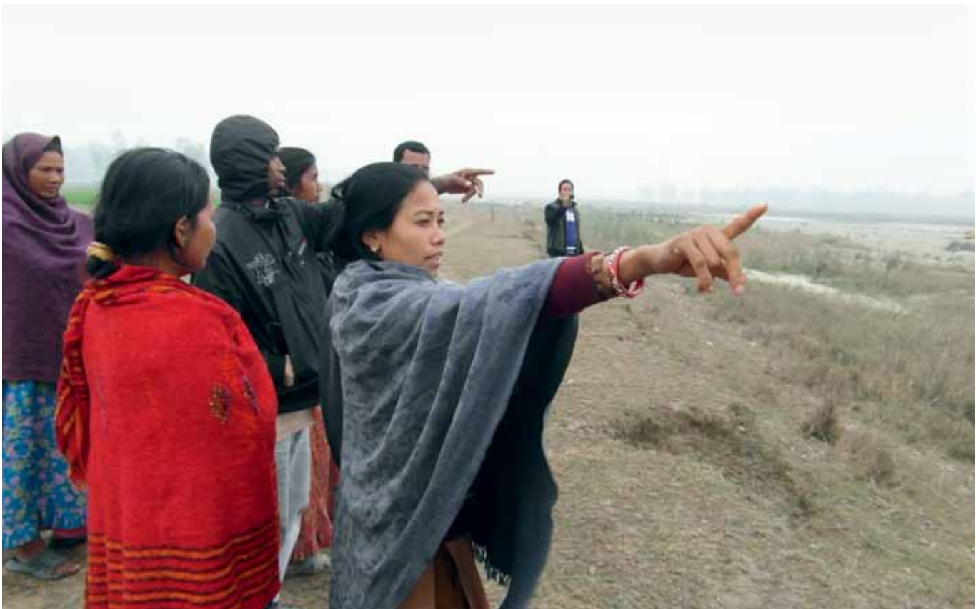
↑ Community members presenting contentious land issues—Nepal.

related extraterritorial obligations (ETO) created by conflicts of an Indo-Nepal national park in Kanchanpur, among others. In addition, three communities were able to successfully claim their right to irrigation and the right of the Dalits to housing and land, thanks to the collective effort of district-level right to food networks and the supportive action of duty bearers. In 2013, lobby and advocacy work was done on different levels. The National Dalit Commission (NDC) secretary visited Dalit Gandharva and the community, and achieved financial support to construct 15 houses. FIAN Nepal also worked jointly with the National Human Rights Commission and FAO to finalize the indicators for monitoring the right to food. In joint cooperation with FIAN International and the ETO Consortium, a South Asia Regional Workshop on ETO and Access to Natural Resources was organized in Kathmandu. Similarly, a national and regional justiciability workshop was organized for lawyers, judges and human rights defenders in technical support from FIAN International. Moreover, representatives from FIAN Nepal at the national and regional level participated in an Economic, Social and Cultural Rights training organized by FORUM Asia, Arrow/Malaysia and FAO in Bangkok, Thailand. ▴