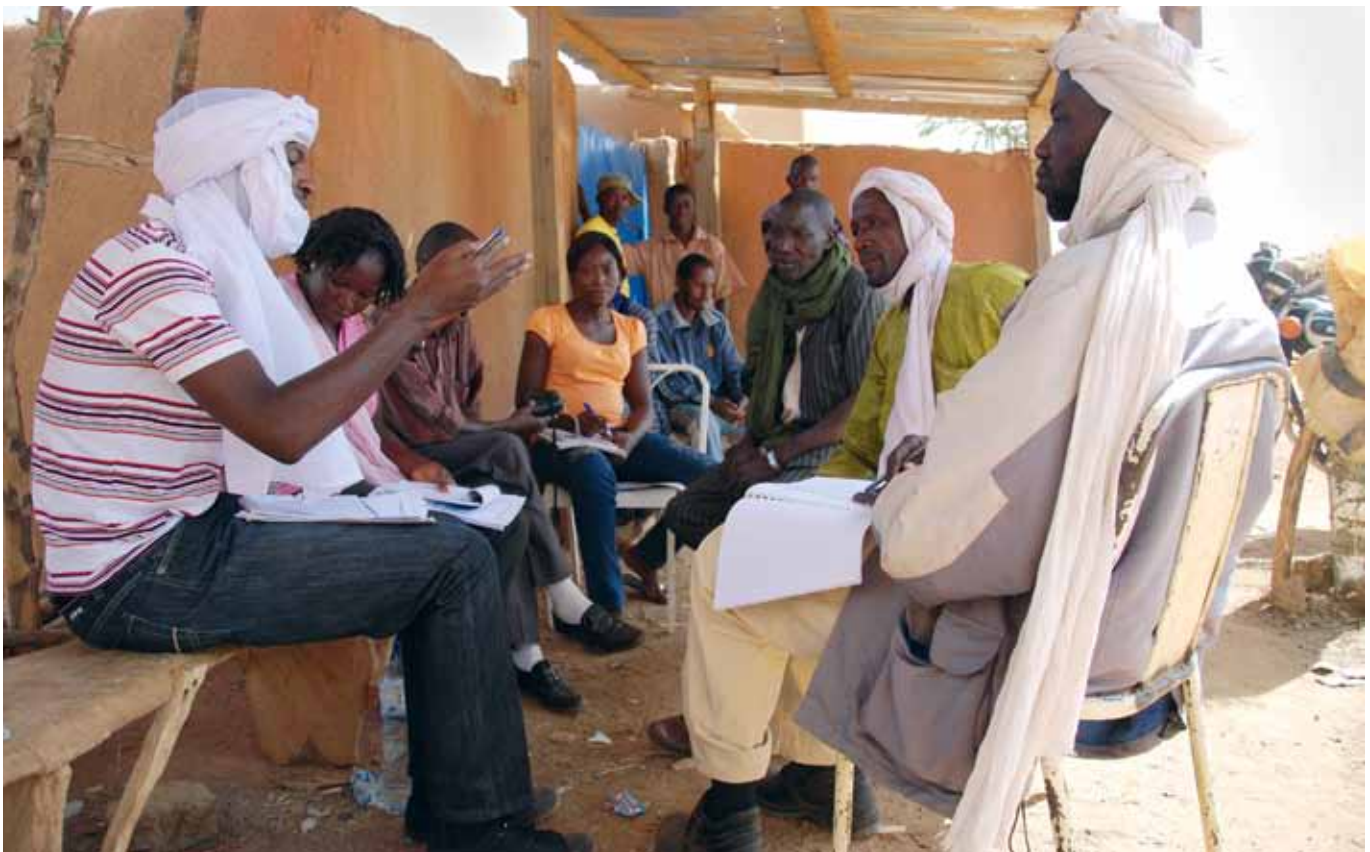
↑ Community members at a village meeting—Mali.

with them ways to deal with their concerns. Other important activities included the screening of a documentary on the Essakane case, and a report submitted by FIAN Burkina Faso in collaboration with the International Secretariat to the Human Rights Council's Universal Periodic Review in April. ▀