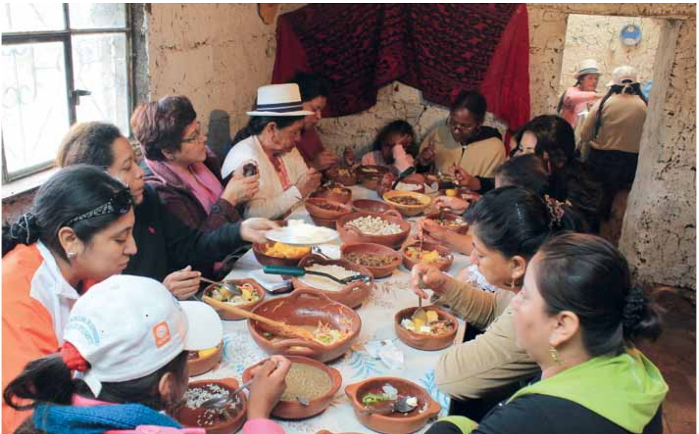
↑ Women's gathering for the right to food—Casaloma, Azuay, Ecuador.