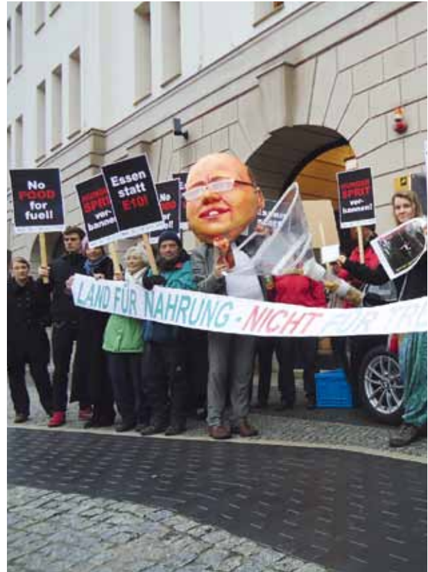
↑ Protests against agrofuels—Berlin, Germany.

Furthermore, FIAN Germany lobbied the European Commission to activate the human rights clause in the "Everything-but-Arms-Initiative" with Cambodia because of human rights violations in the sugar industry. Also, FIAN Germany continued supporting communities in Colombia affected by coal mining and investigated the human rights responsibilities of German energy suppliers us-