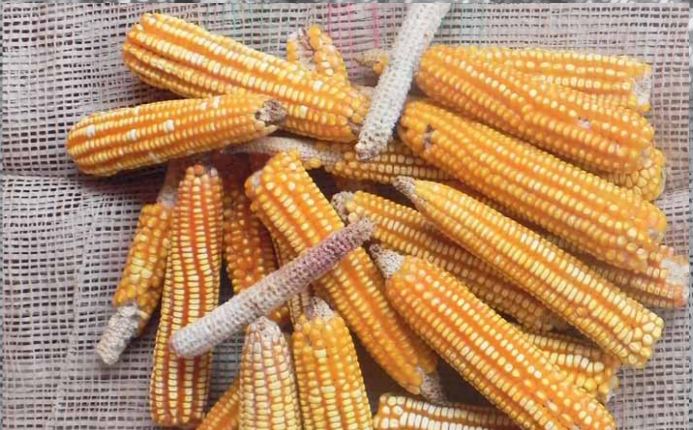
↑ Native maize from peasants of Quevedo—Ecuador.