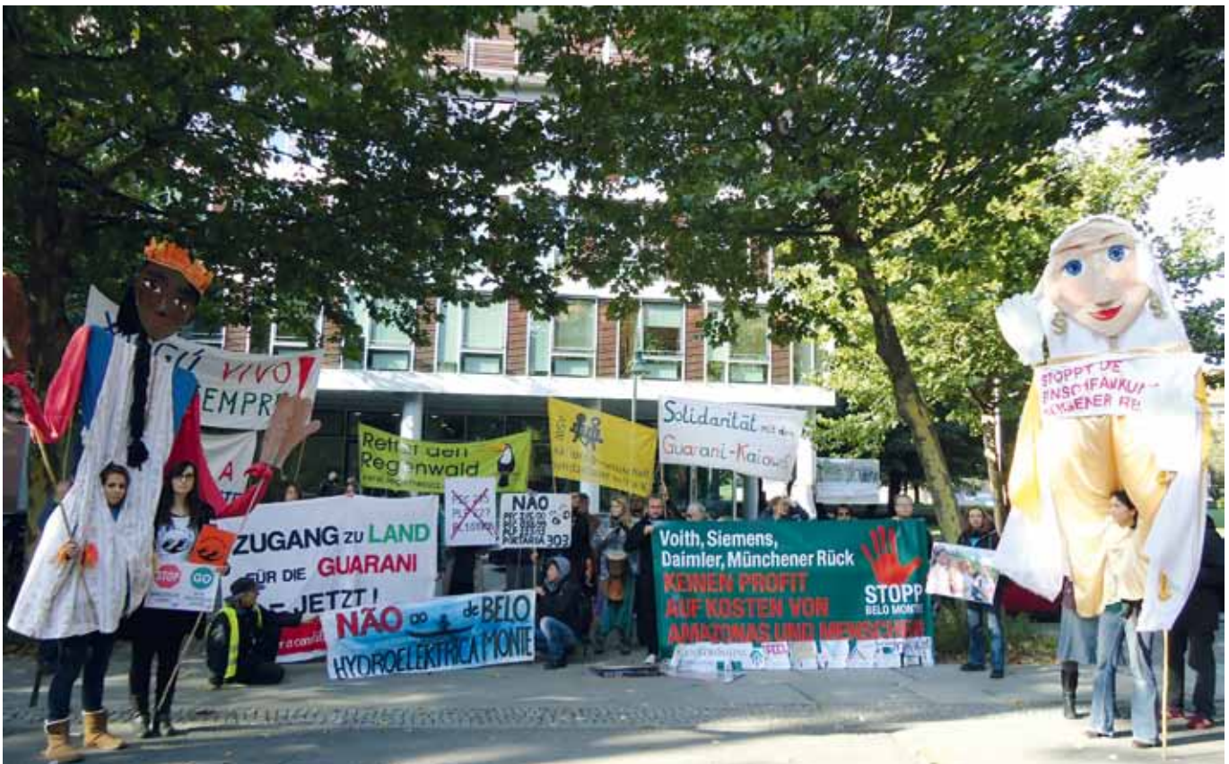
↑ Demonstration in front the Brazilian embassy in Berlin—Germany.