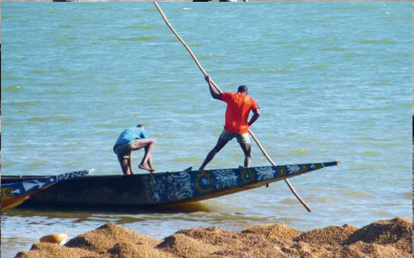
↑ Men on fishing boat—Mali.