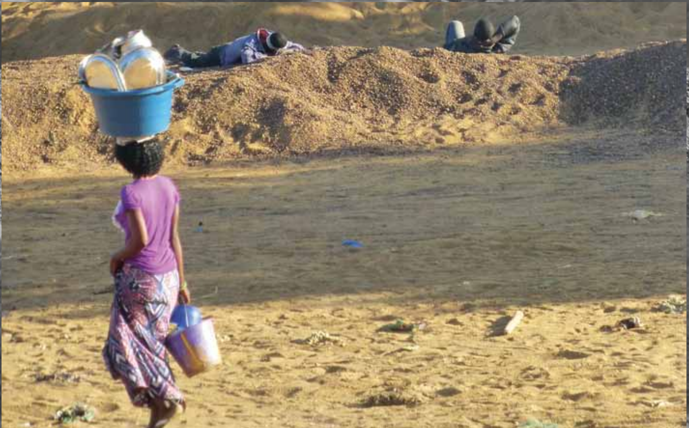
↑ Woman carrying a dish bucket—Mali.