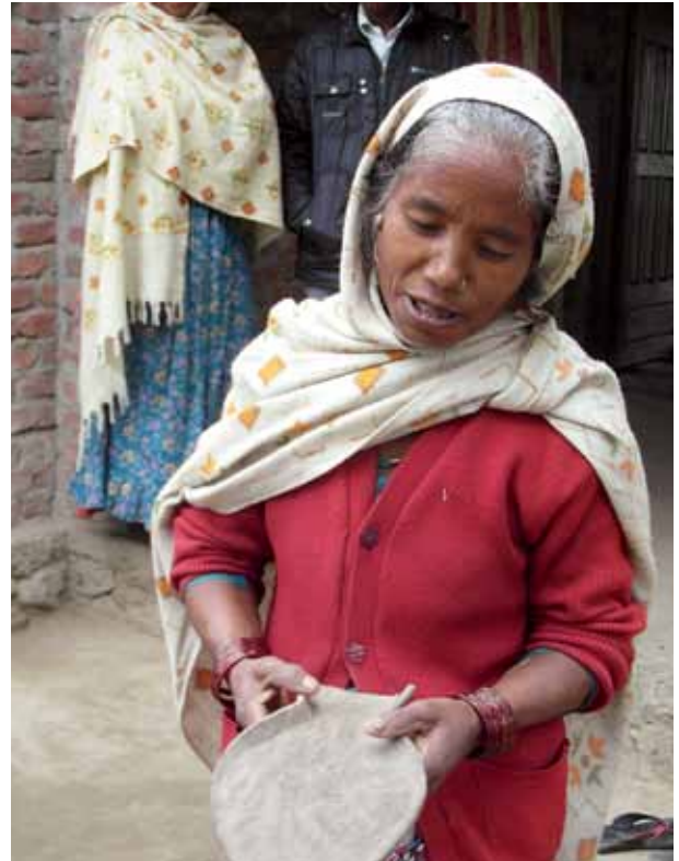
↑ Woman showing special instrument used for traditional gold panning—Nepal.