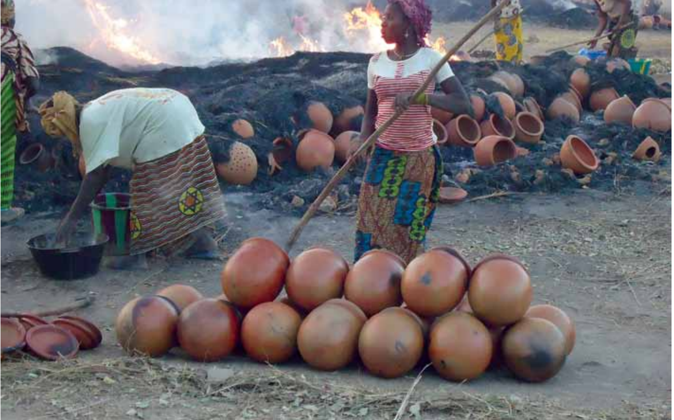
↑ Woman baking clay pottery in hot ashes—Mali.