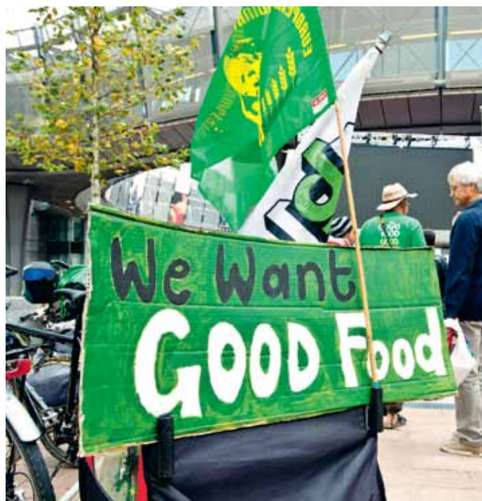
↑ March for Good Food in Brussels—Belgium.

2013 was a significant year for FIAN Philippines' case work with two main cases focusing on the issues of land tenure and agrarian reform. In Hacienda Luisita, around 6,000 farmers were finally able to receive land ownership titles under the government's Comprehensive Agrarian Reform Program (CARP), after the Supreme Court ordered in 2012 the redistribution of the Hacienda to its farm workers. In Hacienda Matias, 2,000 hectares of a private coconut plantation still need to be distributed to its tenants as part of the CARP mandate. Although the Office of the President favored the peasants with ownership titles in April 2013, a decision is still pending. Farmers in Hacienda Luisita and Matias, with the support of FIAN Philippines and others, continue to pressure the government to fully implement the law. In February, the National Food Coalition, a network of over 50 organizations, with FIAN Philippines' president as convener and the section as its Secretariat, launched a campaign to push for a national framework law in the Philippines on the right to food. A conference with more than 100 participants recognized the lack of a comprehensive law on right to food and affirmed the need for a national policy that guarantees the right to food of all Filipinos. ▴