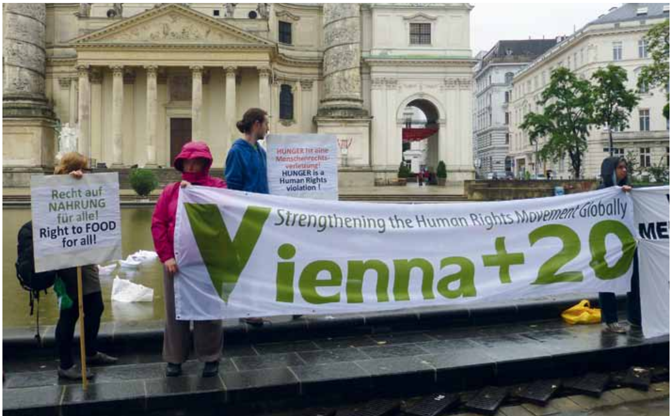
↑ Public event during the Vienna+20 action week—Austria.