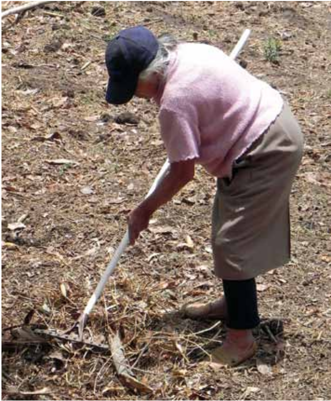
↑ Woman working on community land—La Toggla, Ecuador.