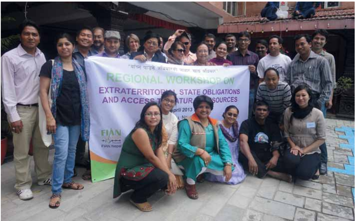
↑ Regional Workshop on Extraterritorial Obligations—Nepal.