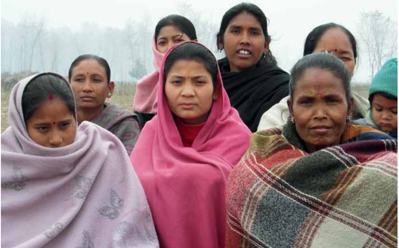
↑ Women in Nepal.