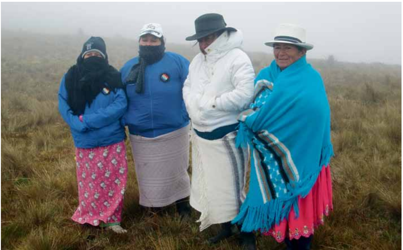
↑ Peasant women visiting the Páramo of Kimsacocha—Azuay, Ecuador.