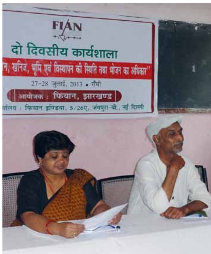
↑ Workshop organized by FIAN in Jharkhand—India

FIAN in Jharkhand organized a two-day workshop on mines, minerals, land, displacement and right to food with participants from different local organizations. At the workshop, strategies to enhance resettlement