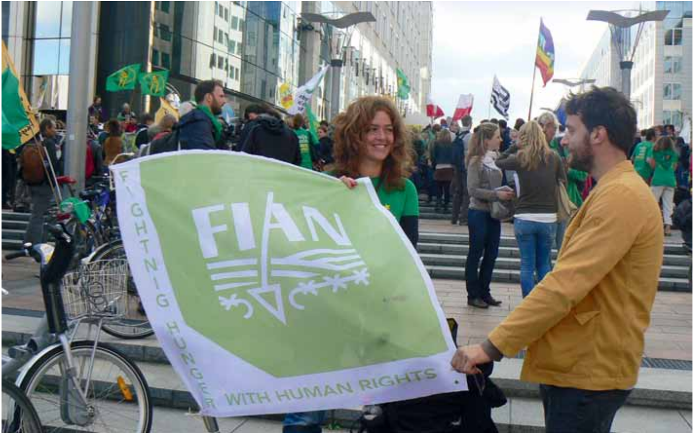
↑ FIAN activists at a rally in Brussels—Belgium.