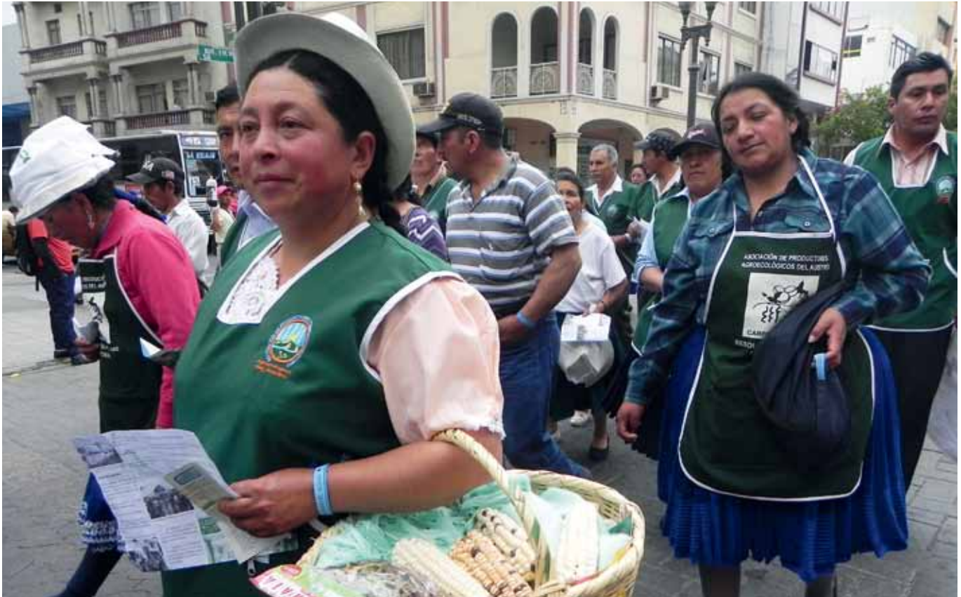
↑ Demonstration on World Food Day—Guayaquil, Ecuador.