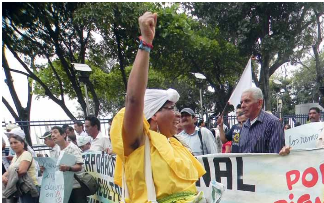
↑ March for Food Sovereignty on World Food Day—Guayaquil, Ecuador.

in conditions of marginalization, discrimination, persecution and violence due to their lack of access to ancestral communal territory. In 2013, FIAN actively engaged in lobby work in these cases by sending letters to the European Parliament and the Brazilian government to demand a full investigation of the criminalization against indigenous leaders and violence against communities, the punishment of the involved, and the speeding up of the homologation process of the Guarani-Kaiowá territories. Moreover, FIAN launched a worldwide petition in October to demand the Brazilian authorities reject proposed retrogressive legislations that modify public policies and procedures regarding the access to land by indigenous peoples and traditional communities, and to guarantee their right to territory in accordance with the current land titling policy. Peasant and indigenous communities of the Kimsakocha-Loma Larga highlands in Ecuador have suffered the violation of their right to free, prior and informed consultation regarding the granting of a mining concession on their land to a Canadian mining company by the Ecuadorian government. In addition, a recent mining law disregards the State's obligation to ensure the right to territory of these peasant and indigenous communities, threatening their right to food and water, since the affected lands are water sources for drinking and farming activities. Protests were held in response to these developments,