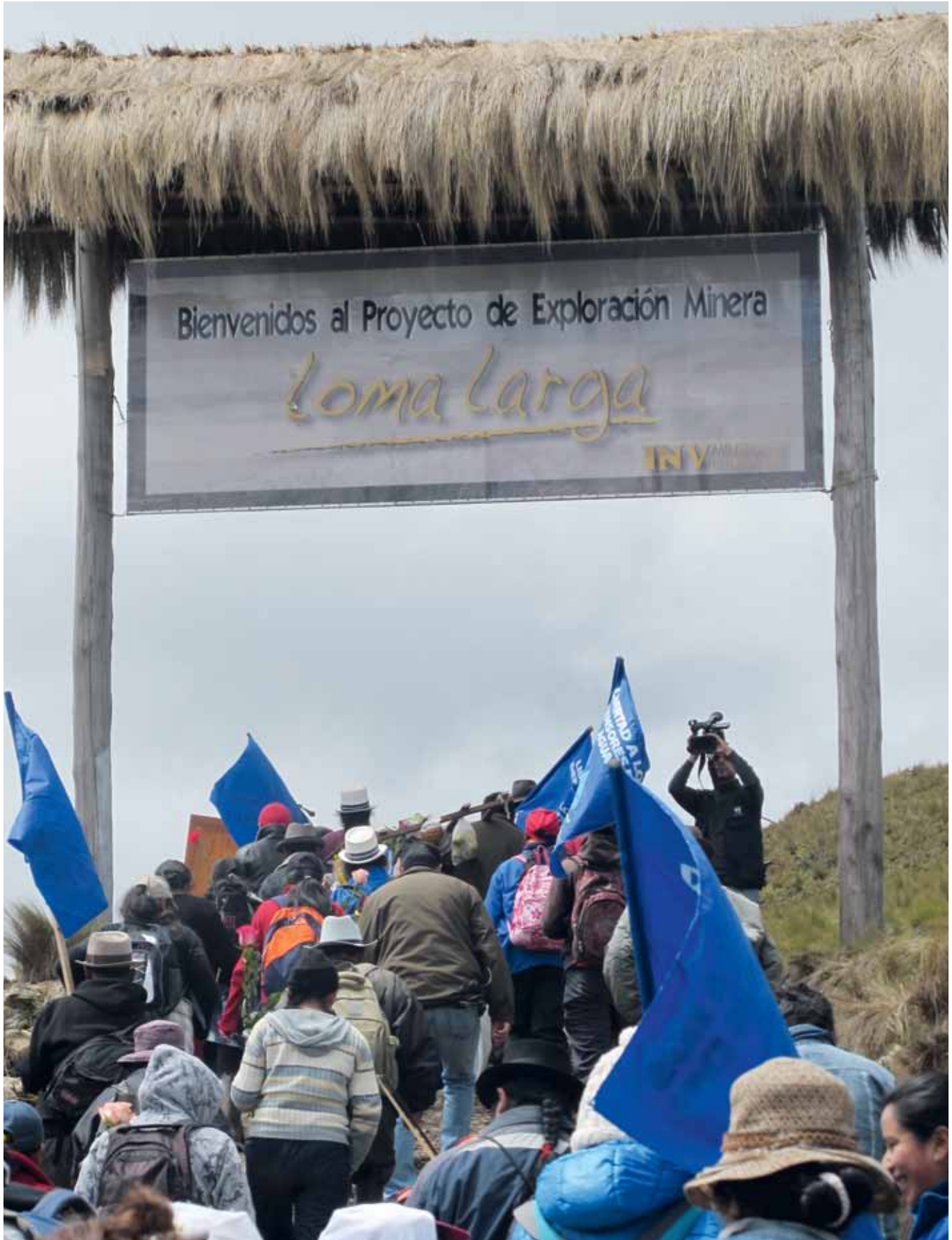
↑ Pilgrimage to the Páramo of Kimsakocha area, where the Loma Larga mining project is being implemented—Ecuador.