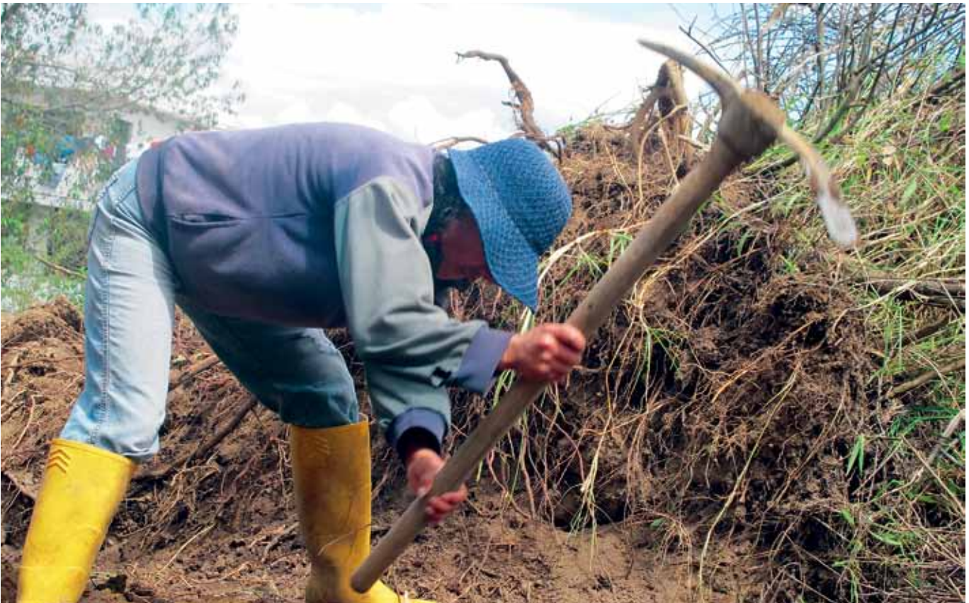
↑ Communal Work—La Toglla, Ecuador.