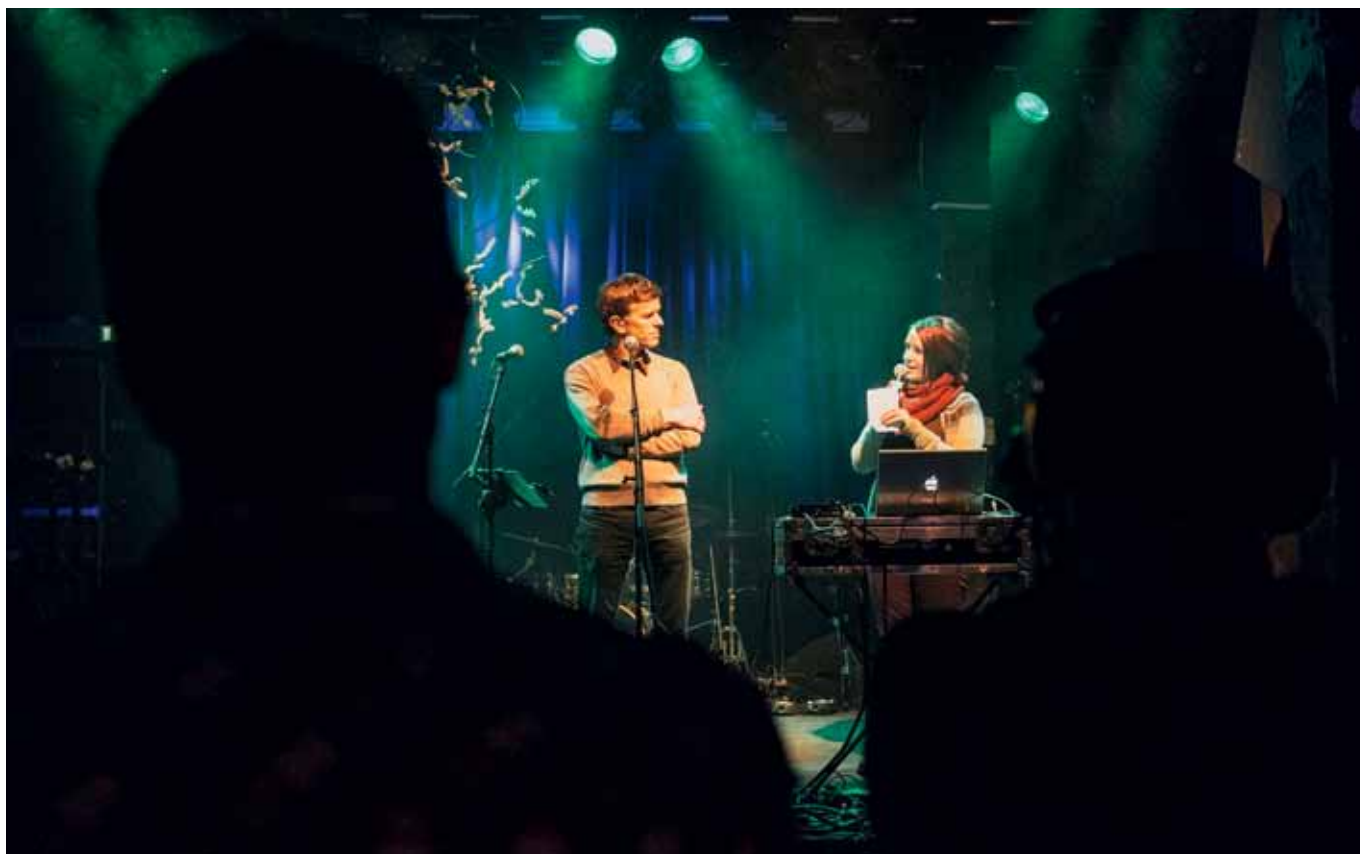
↑ MatBeat—FIAN Norway celebrating World Food Day, in collaboration with Spire and Utviklingsfondet.

Most of FIAN Sweden’s lobbying efforts and activities in 2013 were aimed at changing the regulations on public pension funds’ investments in Sweden. Because joint funds are one of the world’s largest investors and regulations for investments lack coherence with Sweden’s human rights commitments, two case-related speakers’ tours were hosted focusing on Swedish public pension funds’ investments in extractive industries. In March, an event including public seminars and docu-